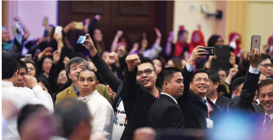
RIYADH: Members of the Filipino community react as they attend Philippine President Rodrigo Duterte's meeting in the Saudi capital. Duterte is on a three-day visit to meet Saudi leaders for investment, trade and support for overseas Filipino workers in the Kingdom. (Right) Saudi Arabia's King Salman bin Abdulaziz Al-Saud (right) and Philippines President Rodrigo Duterte review the honor guards in the capital Riyadh.