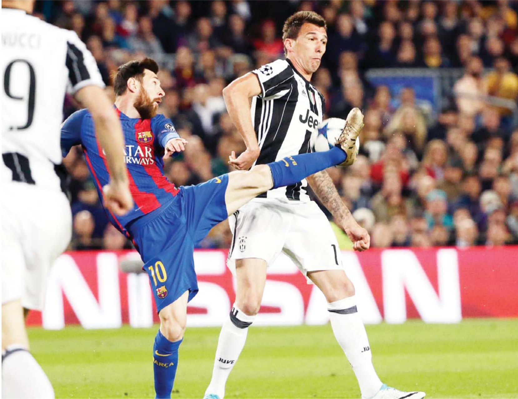
BARCELONA: Barcelona's Lionel Messi fights for the ball with Juventus' Mario Mandzukic, right, during the Champions League quarterfinal second leg soccer match between Barcelona and Juventus at Camp Nou stadium in Barcelona, yesterday.

BARCELONA: Barcelona failed to produce another miraculous Champions League comeback as Juventus held out for a 0-0 draw at the Camp Nou yesterday to reach the semi-finals 3-0 on aggregate.