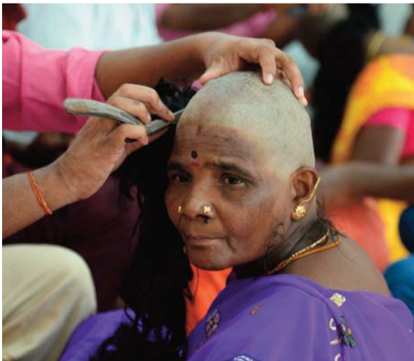
An Indian Hindu devotee gets her head shaved at the Thiruthani Murugan Temple.

Business has to move quickly at the temple, one among the six holy shrines of deity Lord Murugan. From four in the morning to sundown barbers clip away. Pilgrims queue for hours, sometimes much longer on festival days, to make their sacrifice. Tens of thousands, including women and children, shave their heads here every year, applying a bright yellow paste of tumeric powder before offering their prayers. Pilgrims climb 365 steps to reach the shrine, which is open year round. The profits from the sale of their hair goes towards the upkeep of the temple.