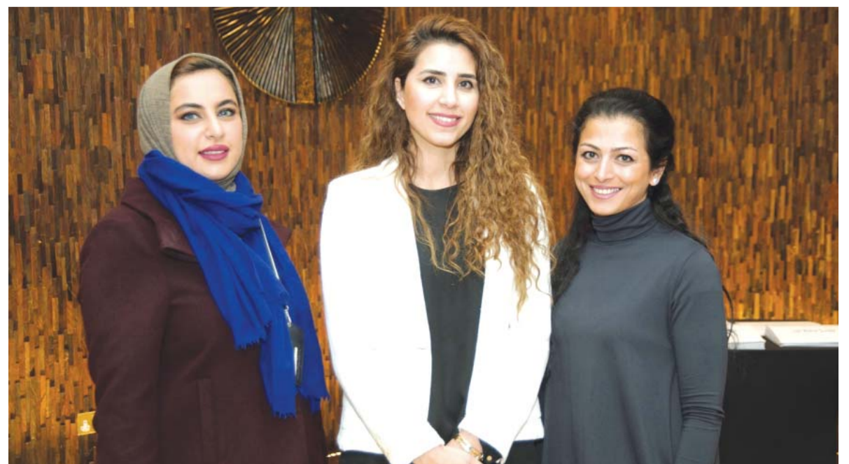
Gulf Bank staff members during the training.

Fitch Learning is part of Fitch Group and is a platform that provides knowledge and skills and enhances conducts. Fitch Group is a global leader in financial information services with operations in more than 30 countries. For more details about Gulf Bank initiatives, please visit the bank's website: www.e-gulfbank.com or its social media accounts.