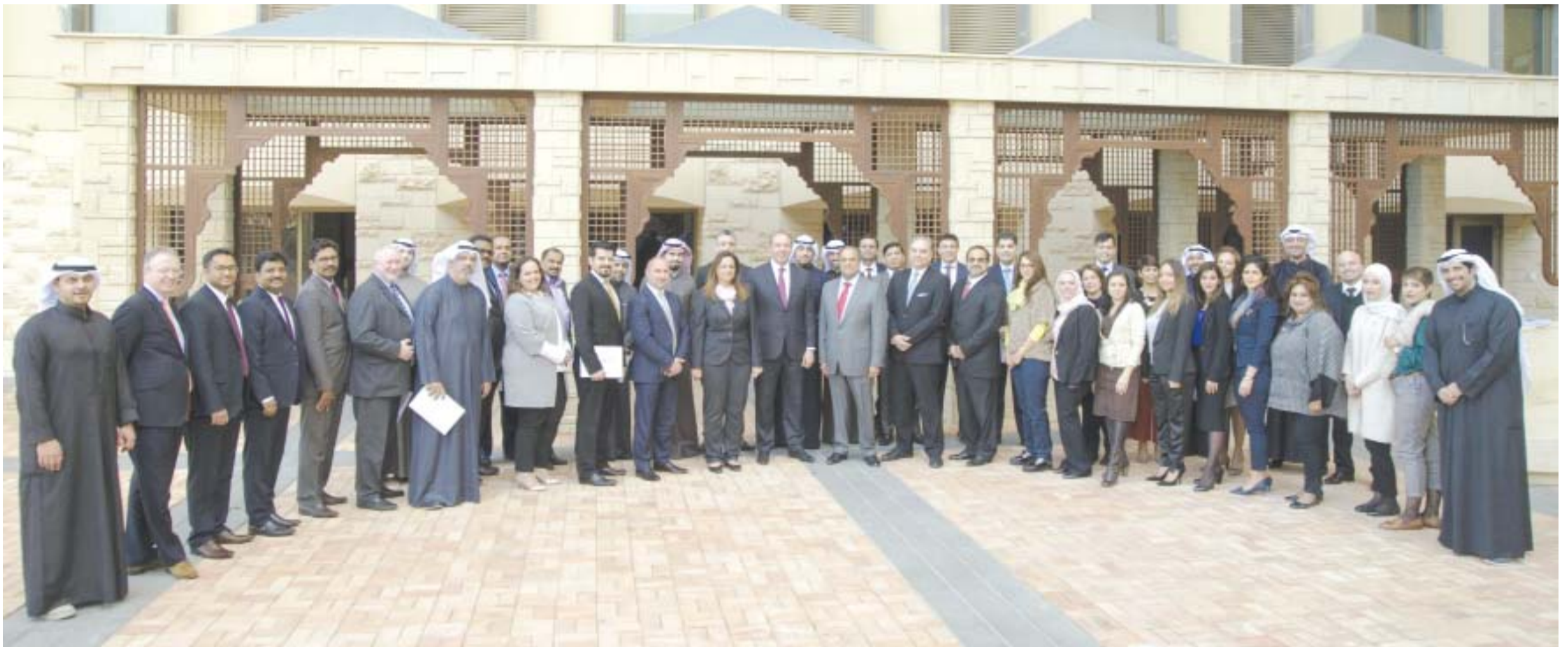
Gulf Bank staff pose for a group photo at the completion of the training.