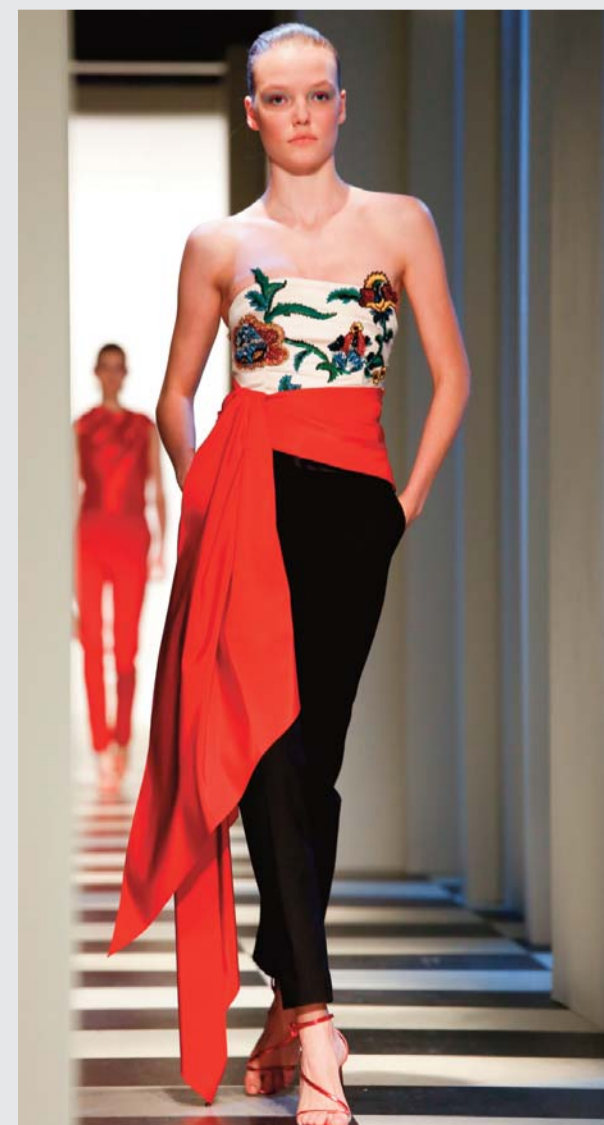
Models walk the runway for the Carolina Herrera collection during, New York Fashion Week.