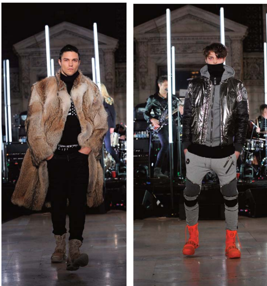
The Philipp Plein fashion collection is modeled during Fashion Week in New York, Monday.