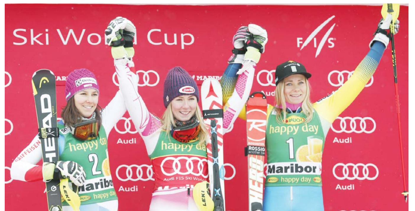
MARIBOR: From left, Switzerland's Wendy Holdener, second placed, Mikaela Shiffrin, the winner, of the United States, and Sweden's Frida Hansdotter, third placed, celebrate on podium after an alpine ski, women's World Cup slalom in Maribor, Slovenia, yesterday.

The women's World Cup travels to Austria for a night slalom in Flachau on Tuesday, followed by a downhill and a combined event in Altenmarkt-Zauchensee at the weekend.