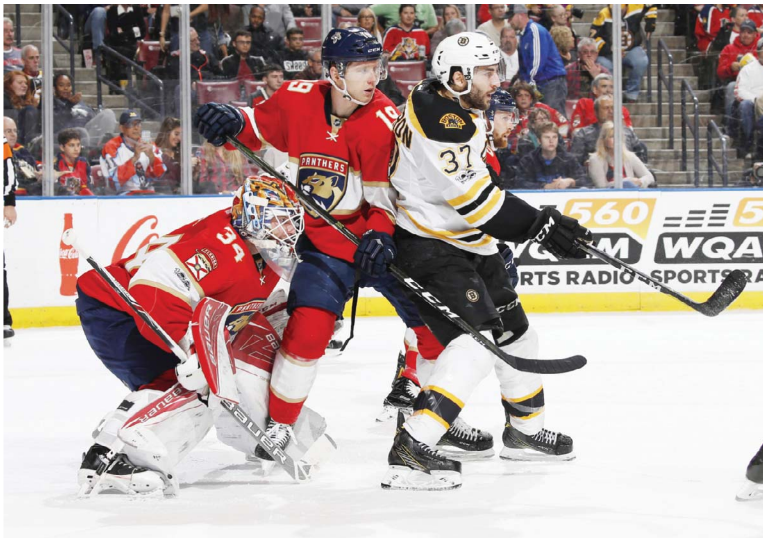
SUNRISE: Goaltender James Reimer #34 looks towards the blue line as Michael Matheson #19 of the Florida Panthers checks Patrice Bergeron #37 of the Boston Bruins in front of the net at the BB&T Center on Saturday in Sunrise, Florida. The Bruins defeated the Panthers 4-0.

Cornet was the runner-up in Brisbane after going down 6-0 6-3 to Pliskova in the final. "I am very sad I am not being able to play the tournament at Hobart this year," she said in a video message on Twitter. "It was meaning a lot to me to come back here and defend my title but I have to be reasonable. "My back is not doing great and I have just one week to get ready for the Australian Open. I hope I can make it on time."