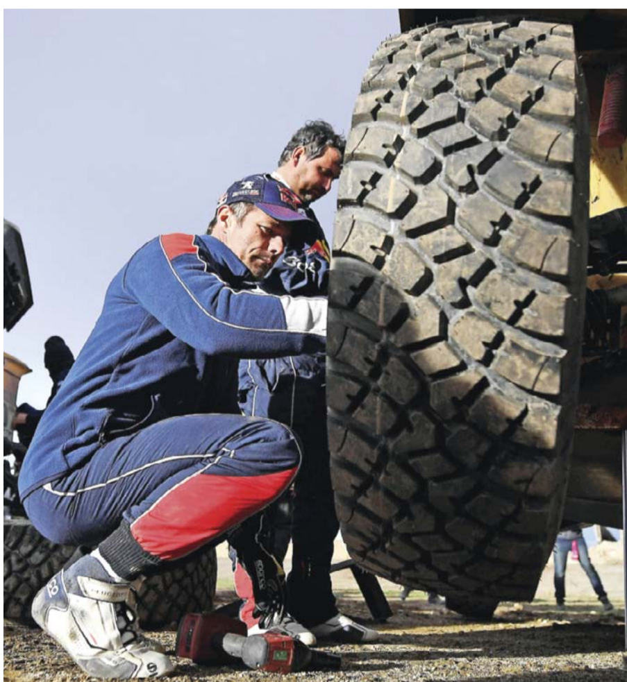
LA PAZ: Peugeot's French pilot Sebastien Loeb works on his car at the bivouac in Uyuni, Bolivia, after Stage 7 of the 2017 Dakar Rally between La Paz and Uyuni, on Monday.