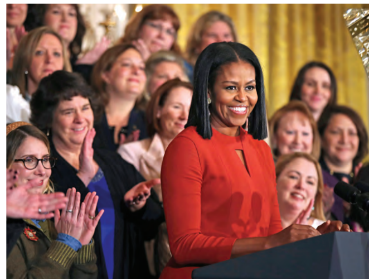
First lady Michelle Obama smiles as she speaks at the 2017 School Counselor of the Year ceremony in the East Room of the White House in Washington.