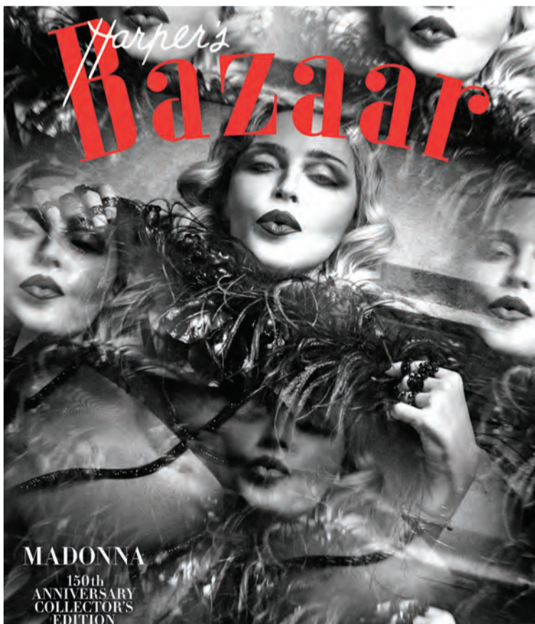
This image provided by Harper's Bazaar shows the cover of the February issue featuring Madonna.