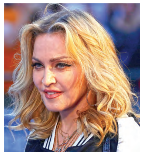
In this file photo, musician Madonna poses for photographers upon arrival at the World premiere of the film "The Beatles, Eight Days a Week" in London.

magazine plans a cocktail party to celebrate that fact and its listees the weekend of the Screen Actors Guild Awards ceremony Jan 29. A series of other events to mark its 150th year are planned. — AP