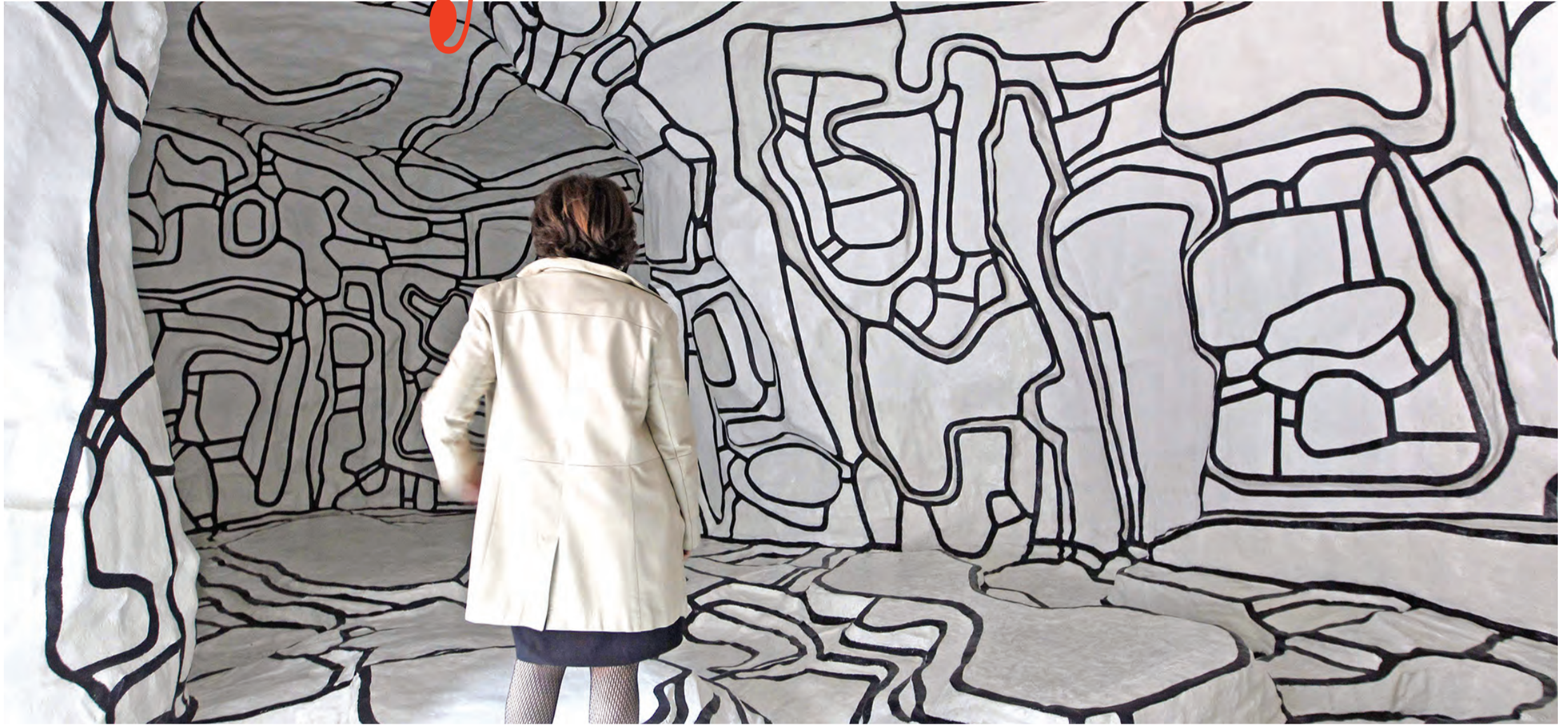
This file photo taken on April 05, 2011 shows a woman looking at Le jardin d'Hiver, 1968-1970, (Winter garden), a work by French artist Jean Dubuffet in the new permanent collection of the national Modern Art Museum at the Georges Pompidou center, also known as Beaubourg, in Paris. The French capital's distinctive Centre Pompidou modern art museum, inaugurated on January 31, 1977, is celebrating its 40th anniversary in 2017.