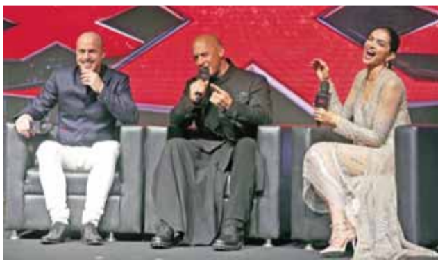
Hollywood actor Vin Diesel, center, speaks with co-star Deepika Padukone, right, and director D. J. Caruso seated beside him during a press conference to promote their film xXx: Return of Xander Cage.