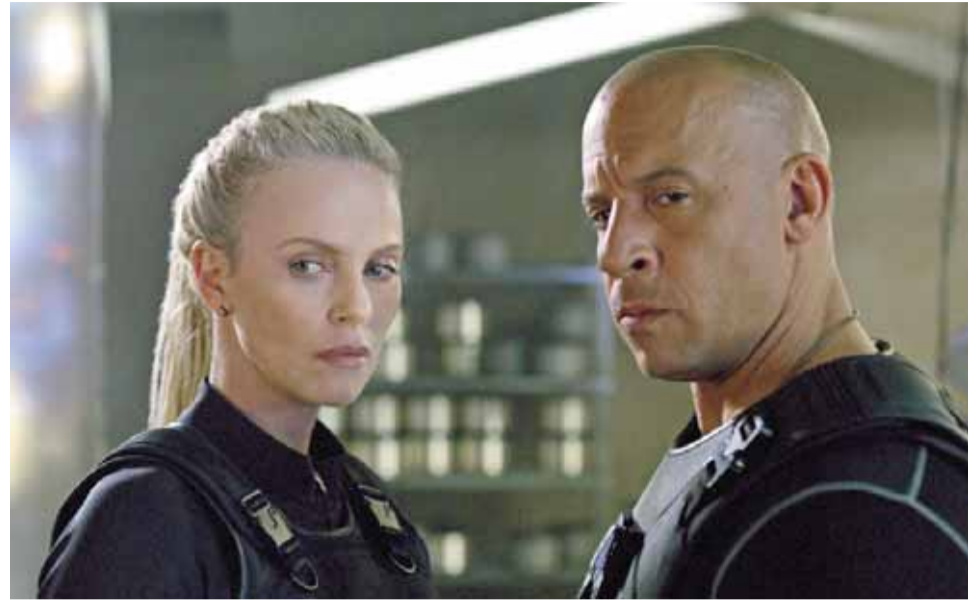
This image released by Universal Studios shows Charlize Theron, left, and Vin Diesel in a scene from 'The Fate of the Furious,' expected in theaters on April 14.