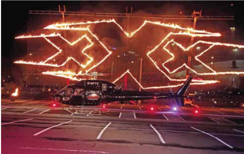
Actor Vin Diesel arrives by helicopter for the premiere of the film 'xXx Return of Xander Cage' in London.