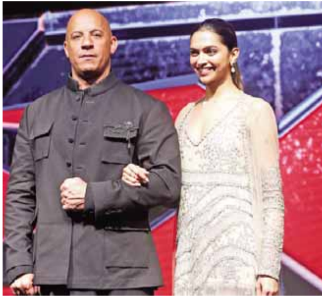
Hollywood actor Vin Diesel, left, and co-star Deepika Padukone attend a news conference to promote their film xXx: Return of Xander Cage in Mumbai, India.