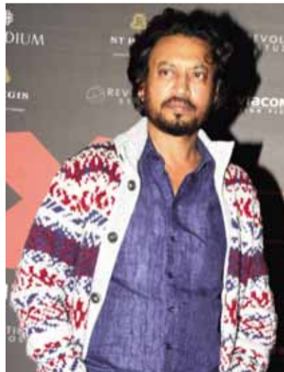
Indian Bollywood actor Irrfan Khan poses as he attends the premiere of Hollywood action thriller film - xXx: Return of Xander Cage.

The film sees Diesel's return to the Zander Cage film franchise after starring in the first movie in 2002 but missing the sequel in 2005. Although thought to be long-dead, the athlete turned government operative in "xXx: Return of Zander Cage" comes out of exile and races to recover a sinister weapon. — Reuters