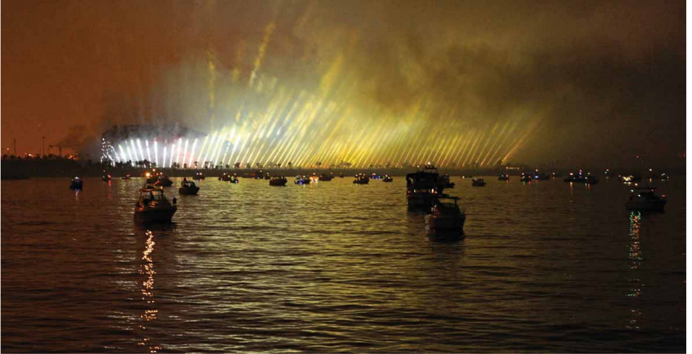
KUWAIT: A laser show at the Jaber Al-Ahmad Cultural Center.