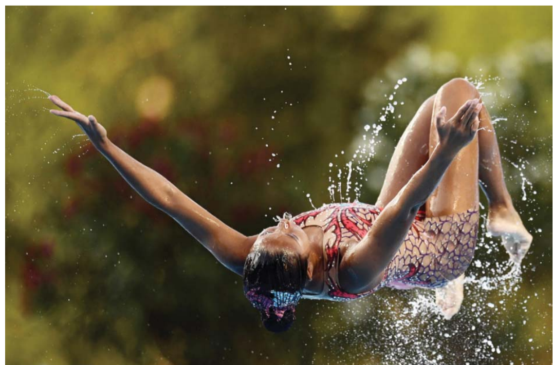
BUDAPEST: Team Singapore competes in the Women's Team Free Routine preliminary during the synchronised swimming competition at the 2017 FINA World Championships in Budapest, yesterday.