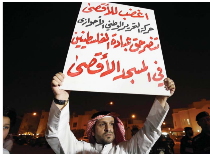
KUWAIT: (Left) Demonstrators gather at the Kuwait University campus in Khaldiya yesterday against Israeli violations at the Al-Aqsa mosque compound. (Right) A man carries a placard with a slogan reading "the National Liberation Movement of Ahwaz supports the right of worship of Palestinians in Al-Aqsa mosque" at a demonstration outside the Palestinian Embassy in Bayan yesterday.