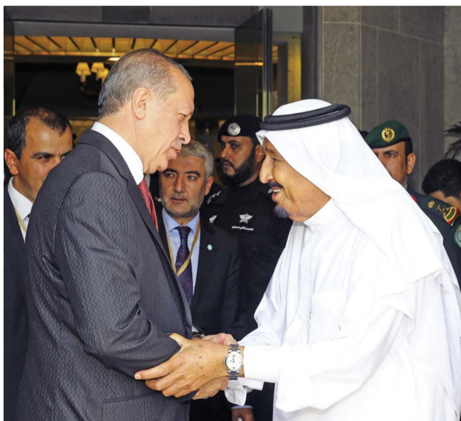
(Left) Turkish President Recep Tayyip Erdogan is welcomed by HH the Amir of Kuwait Sheikh Sabah Al-Ahmad Al-Jaber Al-Sabah upon his arrival at Kuwait International Airport late yesterday. (Right) Erdogan is greeted by Saudi King Salman upon his arrival in Jeddah yesterday.

KUWAIT: President Recep Tayyip Erdogan yesterday began a key trip to the Gulf aimed at defusing the standoff over Turkey's ally Qatar, saying no one had an interest in prolonging the crisis. Erdogan, whose country has come to Qatar's aid in the dispute, had talks in Jeddah with King Salman who hailed the Turkish leader's "efforts in the fight against terrorism and its financing", Saudi state news agency SPA reported. He also met Saudi Crown Prince Mohammed bin Salman before leaving for Kuwait for the second leg of his tour. Erdogan was received by Kuwait's Amir HH Sheikh Sabah Al-Ahmad Al-Jaber Al-Sabah, who has been mediating to resolve the crisis.