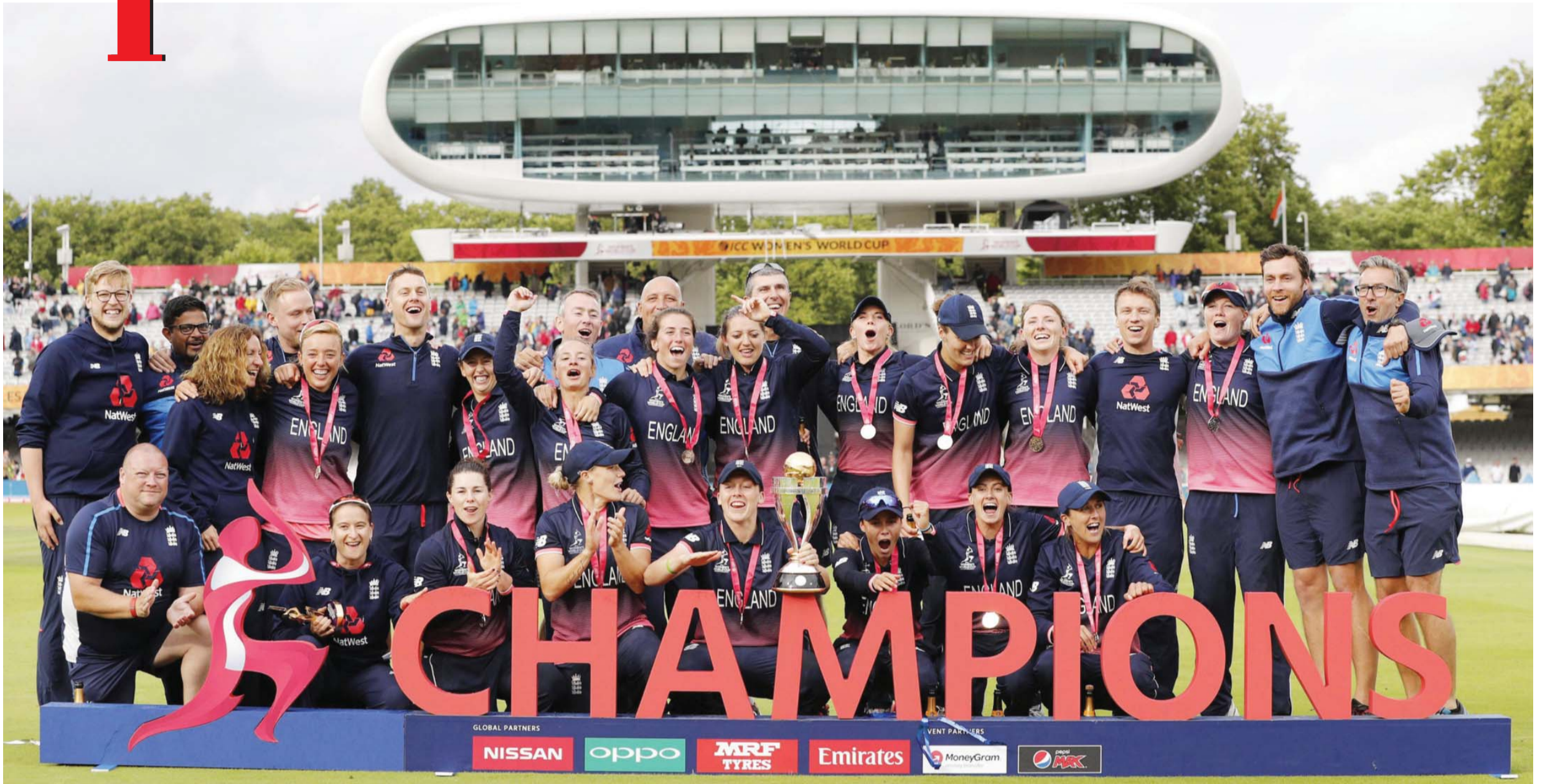
LONDON: England players pose with the trophy after winning the ICC Women's World Cup cricket final between England and India at Lord's cricket ground in London yesterday.