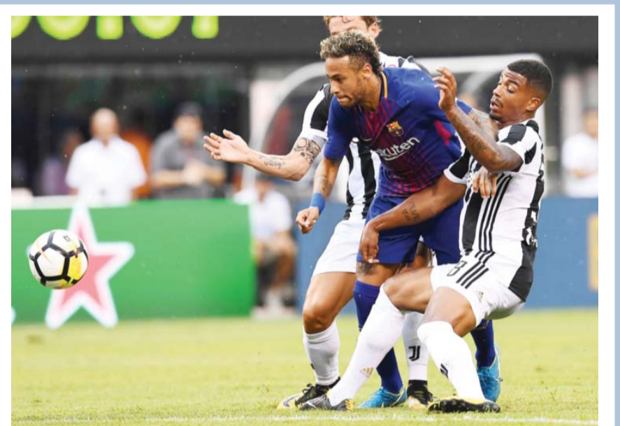
EAST RUTHERFORD: Barcelona's Brazilian forward Neymar (C) vies for the ball with Juventus players during the International Champions Cup (ICC) match between Juventus FC and FC Barcelona, at the MetLife Stadium in East Rutherford, New Jersey, on Sunday. FC Barcelona defeated Juventus 2-1.

Taylor and Sciver put on 83 before Goswami, the all-time leading wicket-taker in women's ODIs, struck in her second spell. Taylor was caught down the leg-side by wicket-keeper Sushma Verma. And 146 for four became 146 for five when Fran Wilson was lbw for a golden duck next ball. But England's tail, with Katherine Brunt making 34, took them past 200 and those runs proved vital in the end. —AFP