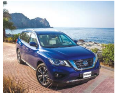
Nissan Al-Babtain launches new 2018 Nissan Pathfinder in Kuwait