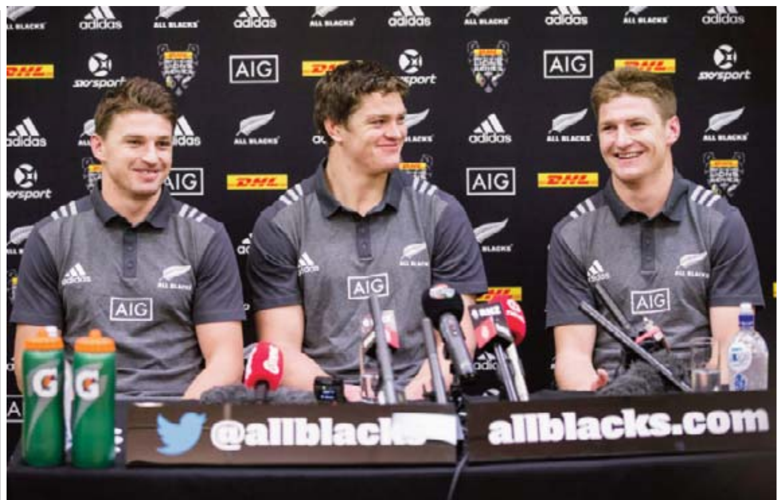
AUCKLAND: Barrett brothers, from left, Beauden, Scott and Jordie are the first trio of brothers to be selected for an All Blacks squad, speak at a press conference in Auckland, New Zealand, yesterday. The All Blacks will play Samoa on Friday, June 16, ahead of the three test series against the British and Irish Lions.

He has made 40 appearances for Harlequins, scoring five tries. Horwill captained Australia on 16 occasions, including during the Wallabies' 2013 series loss to the British and Irish Lions.