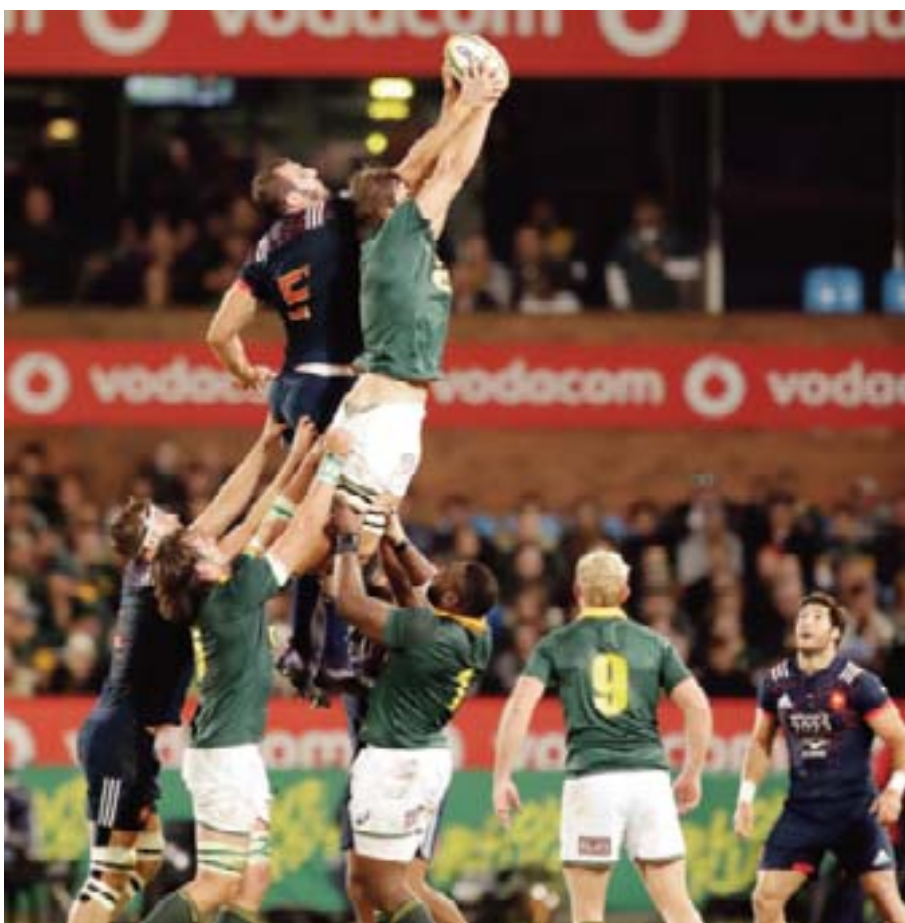
PRETORIA: South Africa's Eben Etzebeth' top right, beats France's captain Yoann Maestri, top left, during a line out for the international rugby union test match between South Africa and France at Loftus Versfeld stadium in Pretoria, South Africa, Saturday.

Lions captain Sam Warburton said the covered roof of the Highlanders' Forsyth Barr stadium should make for a faster game than Saturday's 12-3 win over the Crusaders in Christchurch. "It's a great ground to play in, so I'd imagine the scoreline will be a little bit different to the Crusaders game, it was quite slippery out there," the Welsh flanker said. "I'm sure it's going to be perhaps a little bit quicker, a little bit more ball in play and some more points scored for sure."