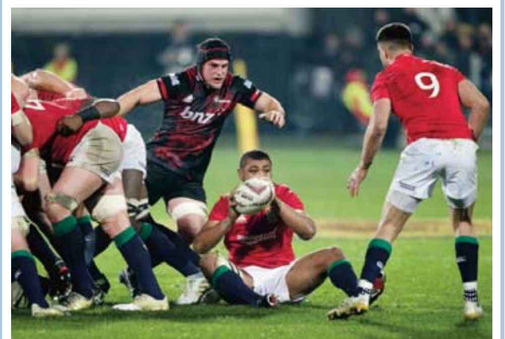
CHRISTCHURCH: British and Irish Lions lose forward Taulupe Faletau, centre, throws the ball to teammate Conor Murray, right, as Canterbury Crusaders Matt Todd watches during their match in Christchurch, New Zealand, Saturday.