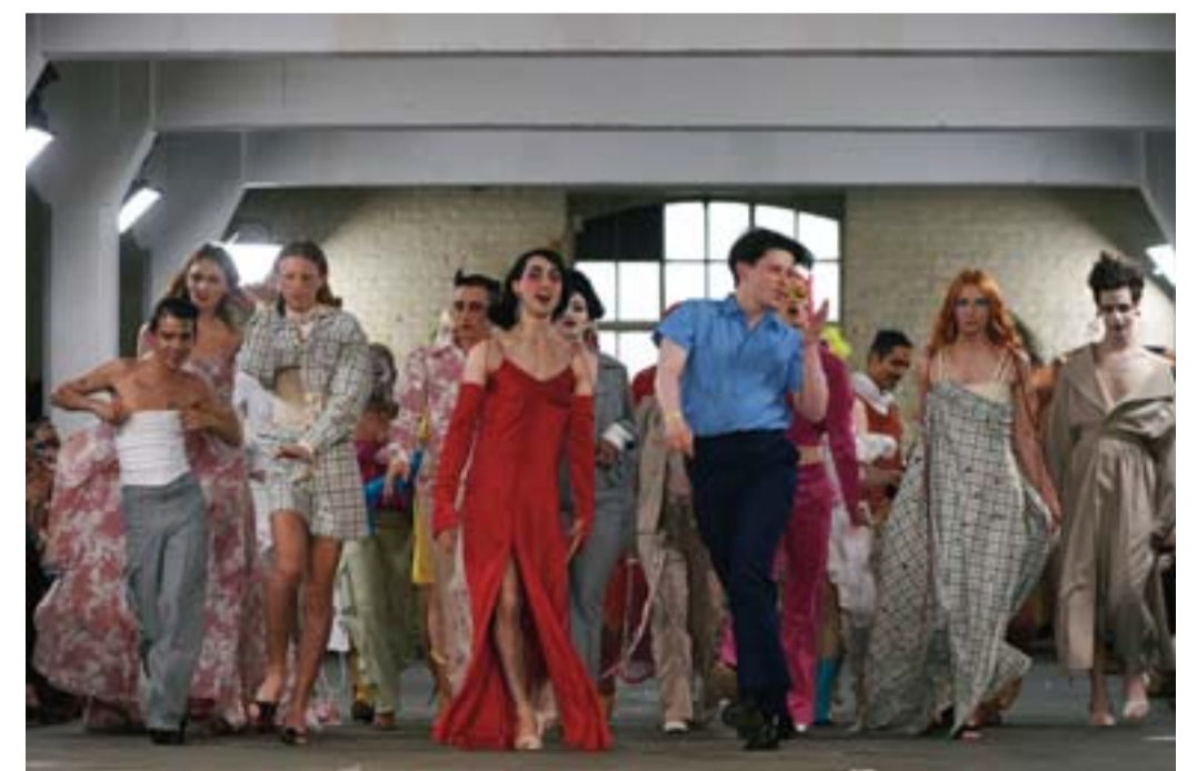
Models present creations at the MAN catwalk show during London Fashion Week Men's June 2017 in London.