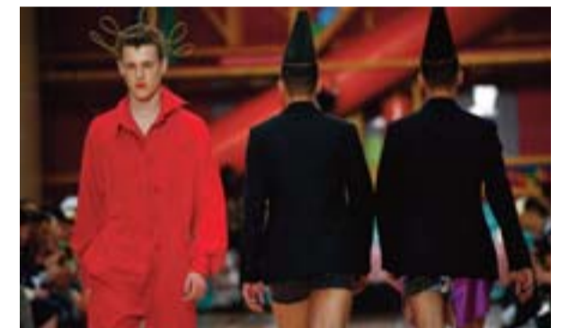
Models present creations by British designer Vivienne Westwood during her catwalk show at London Fashion Week Men's June 2017 in London yesterday.