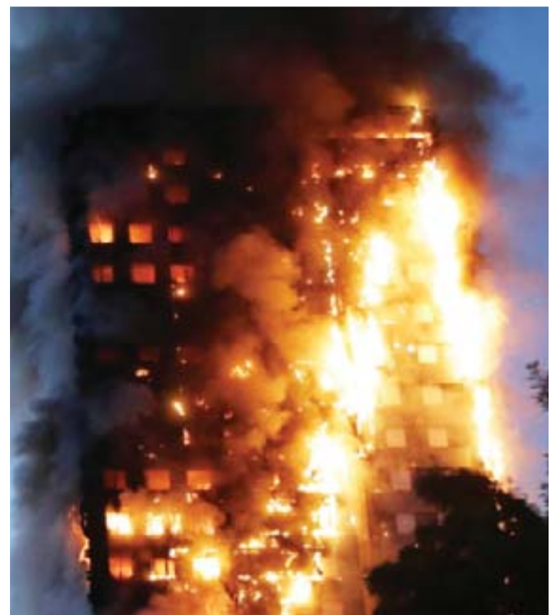
LONDON: Fire engulfs Grenfell Tower, a residential tower block yesterday in west London. The massive fire ripped through the 27-storey apartment block in west London in the early hours of yesterday, trapping residents inside as 200 firefighters battled the blaze.