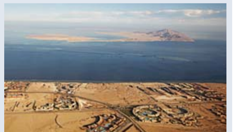
SHARM EL SHEIKH: Photo taken through the window of an airplane shows the Red Sea's Tiran (foreground) and the Sanafir (background) islands in the Strait of Tiran between Egypt's Sinai Peninsula and Saudi Arabia.