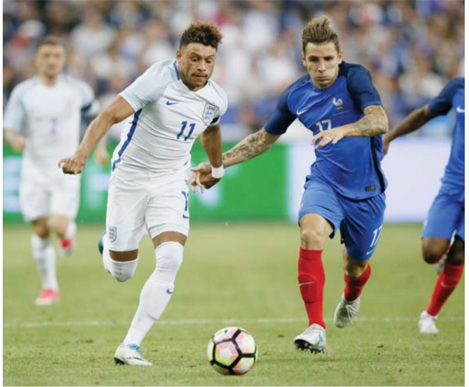
SAINT DENIS: England's Alex Oxlade-Chamberlain, left, outruns France's Lucas Digne during their friendly soccer match between France and England at the Stade de France in Saint Denis, north of Paris, France, Tuesday.

Bookies reacted to the fixtures publication with William Hill making Chelsea 3/1 second favourites to retain their title, with Manchester City 2/1 favourites. Huddersfield are 4/5 favourites for the drop with Brighton and Burnley favoured to join them at 6/5 and 5/4 respectively. — AFP