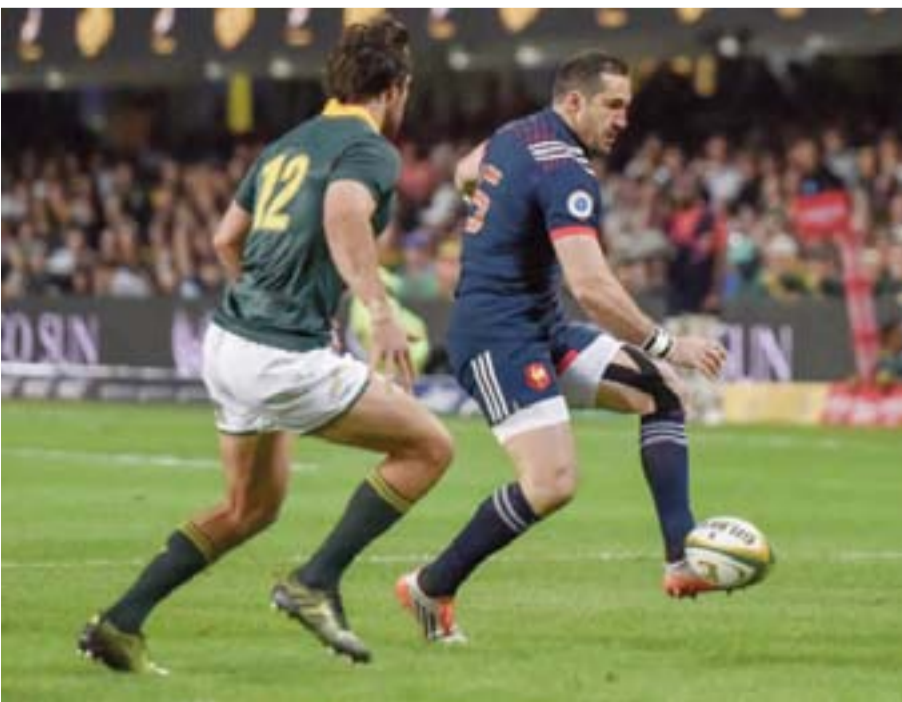
DURBAN: France's Scott Spedding, right, is challenged by South Africa's Jan Serfontein, left, during their international rugby union Test match between South Africa and France in Durban, South Africa, Saturday.

"Siya Kolisi was the standout performer, but every Bok put his body behind the wheel and pushed hard with a roaring performance of few mistakes."—AFP