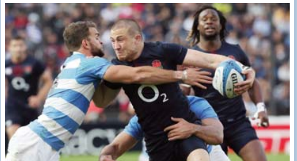
SANTA FE: Argentina's Ramiro Moyano, left, tries to tackle England's Mike Brown during a rugby test match against Argentina in Santa Fe, Argentina, Saturday.

Among the forwards, Jones praised prop Harry Williams, lock Charlie Ewels and flankers Mark Wilson, Sam Underhill and Tom Curry, a teenager. Williams, try-scorer Ewels and Underhill started in Santa Fe, Wilson came off the bench and Curry was rested after a superb first Test display.—AFP