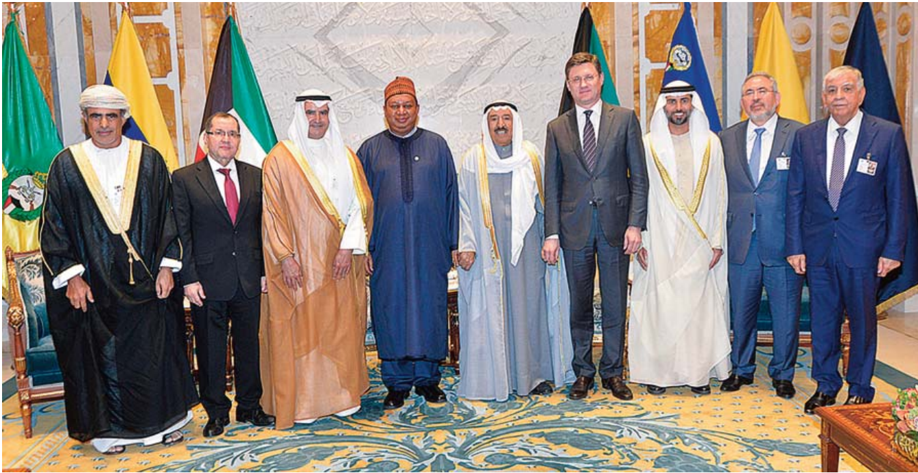
KUWAIT: His Highness the Amir Sheikh Sabah Al-Ahmad Al-Jaber Al-Sabah meets with Minister of Oil and Minister of Electricity and Water Essam Al-Marzouq and members of the Joint OPEC-Non-OPEC Ministerial Monitoring Committee (JMMC).