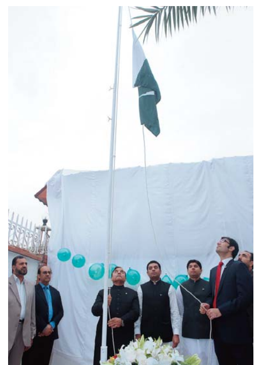
KUWAIT: The Embassy of Pakistan in Kuwait organized a flag hoisting ceremony at its premises over the weekend on the occasion of Pakistan's National Day. Pakistani diplomats, school children and a cross-section of the Pakistani community participated in the event.