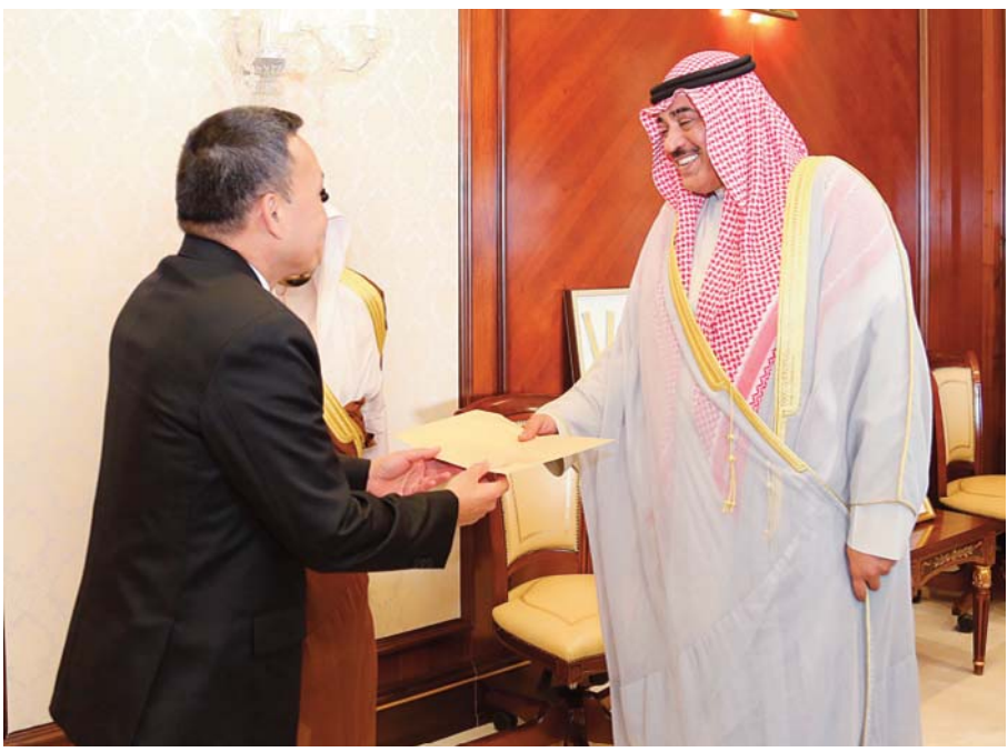
KUWAIT: Kuwaiti First Deputy Prime Minister and Foreign Minister Sheikh Sabah Al-Khaled Al-Hamad Al-Sabah received Sunday the credentials of the Thai ambassador to the State of Kuwait. During the meeting, Sheikh Sabah Al-Khaled wished the new ambassador best of luck in his task and more development of bilateral relations. —KUNA

Sabah Al-Khaled Al-Hamad Al-Sabah. Meanwhile, His Highness the Crown Prince received His Highness Sheikh Jaber Al-Mubarak, Sheikh Sabah Al-Khaled, Deputy Premier and Defense Minister Sheikh Mohammad Al-Khaled Al-Hamad Al-Sabah, Deputy Premier and Interior Minister Sheikh Khaled Al-Jarrah Al-Sabah, in addition to State Minister for Cabinet Affairs and acting Information Minister Sheikh Mohammad Al-Abdullah Al-Mubarak Al-Sabah. —KUNA