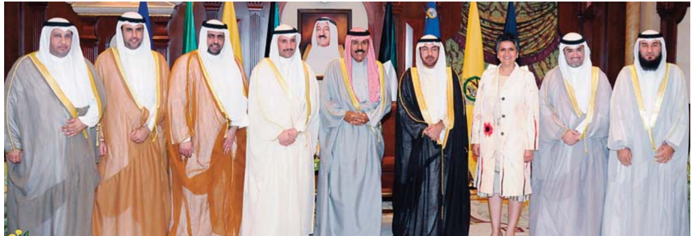
KUWAIT: His Highness the Crown Prince Sheikh Nawaf Al-Ahmad Al-Jaber Al-Sabah meets with National Assembly Speaker Marzouq Al-Ghanem and members of the executive committee of the parliamentary caucus.