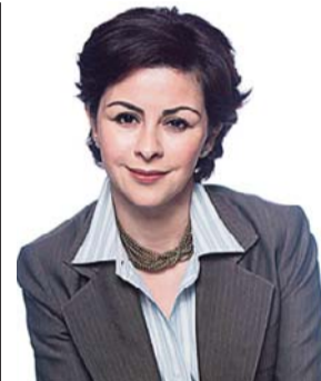
Sheikha Al-Zain Al-Sabah

Moreover, the statement pointed out that certain provisos are in place as it relates to the process of employing non-Kuwaitis and stateless people. On the process of filling up vacancies in the government sector, the statement noted that "priority is given to citizens first, followed by those with Kuwaiti mothers." The statement also clarified that salaries largely hinge on the job itself and that monetary bonuses are dependent upon the occupation. —KUNA