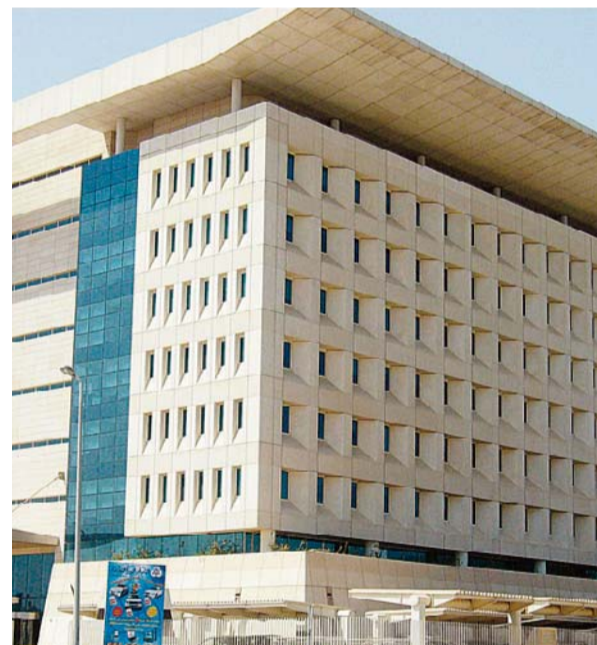
The Civil Service Commission