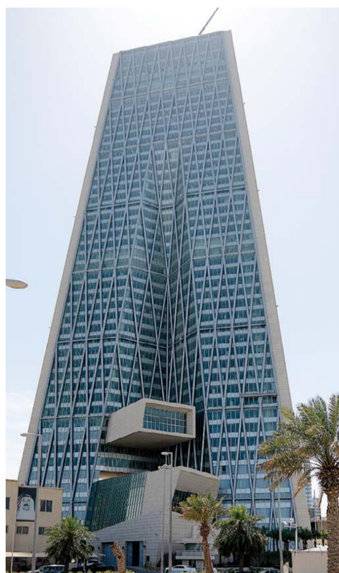
The Central Bank of Kuwait

Sabah to turn Kuwait into a financial and commercial center, the public and private sectors established new buildings for the Kuwait Investment Authority, the Central Bank of Kuwait, the National Bank of Kuwait and the Avenues Mall. — KUNA