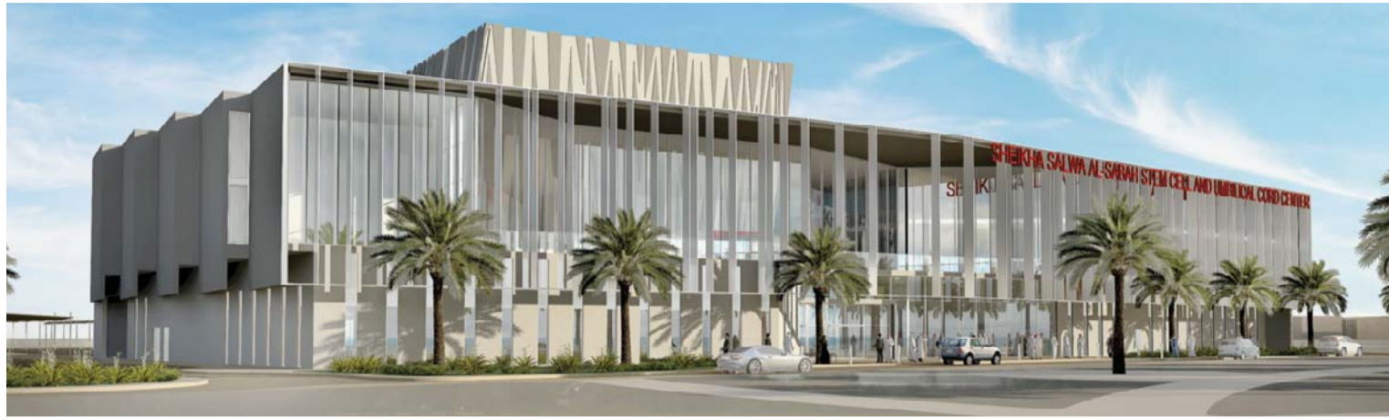
KUWAIT: An artist's rendition of the Sheikh Salwa Sabah Al-Ahmad Center for Stem Cell and Umbilical Cord.