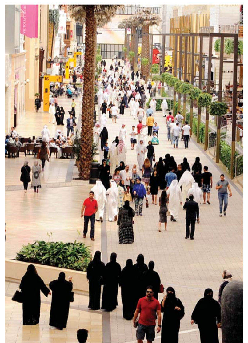
The Avenues Mall