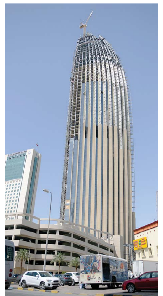
The National Bank of Kuwait