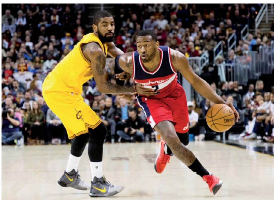
CLEVELAND: John Wall #2 of the Washington Wizards drives past Kyrie Irving #2 of the Cleveland Cavaliers during the first half at Quicken Loans Arena on Saturday in Cleveland, Ohio.