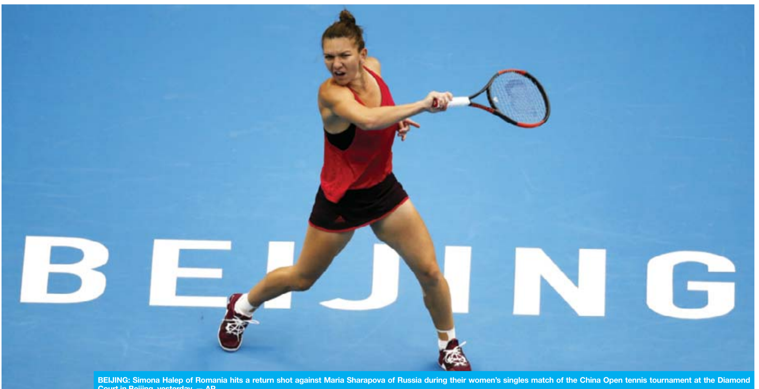
BEIJING: Simona Halep of Romania hits a return shot against Maria Sharapova of Russia during their women's singles match of the China Open tennis tournament at the Diamond Court in Beijing, yesterday.