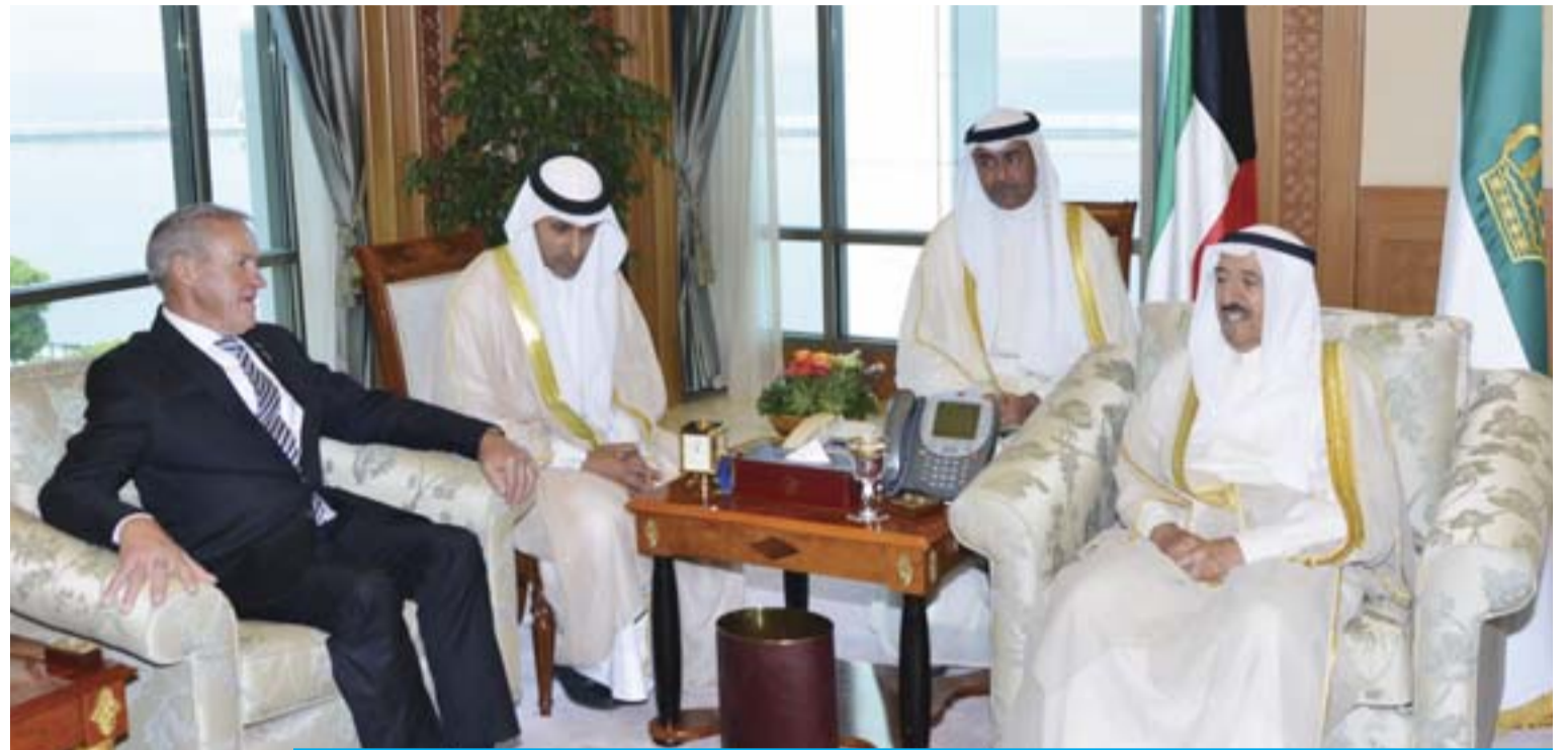
KUWAIT: His Highness the Amir Sheikh Sabah Al-Ahmad Al-Jaber Al-Sabah meets with Speaker of the New Zealand House of Representatives David Carter.