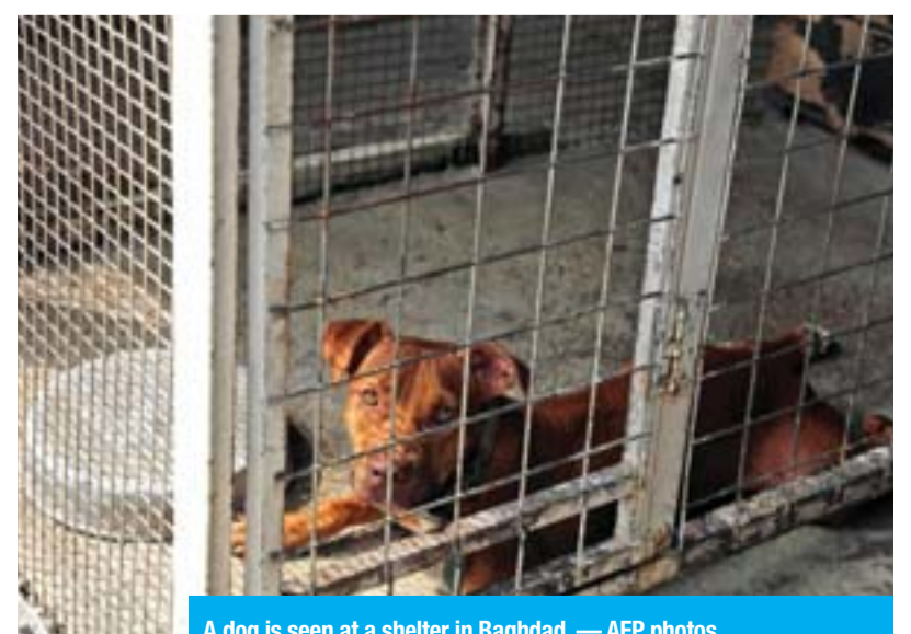
A dog is seen at a shelter in Baghdad.