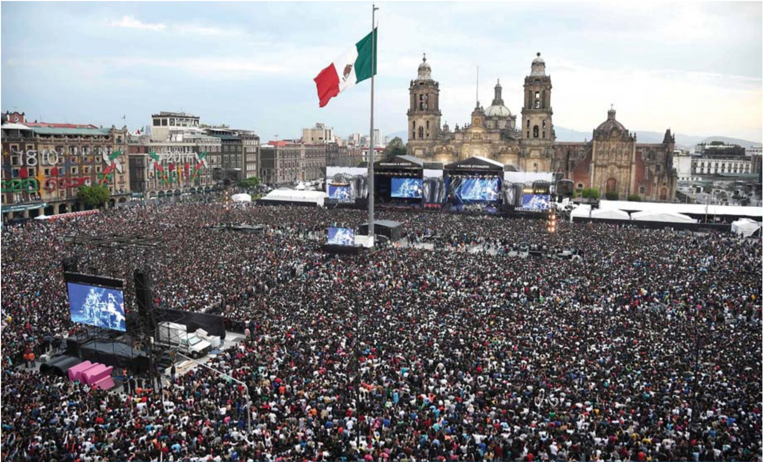
Thousands of people enjoy a concert by Latin music stars to benefit victims of Mexico's September 19 earthquake, at the Zocalo Square in Mexico City on October 8, 2017.