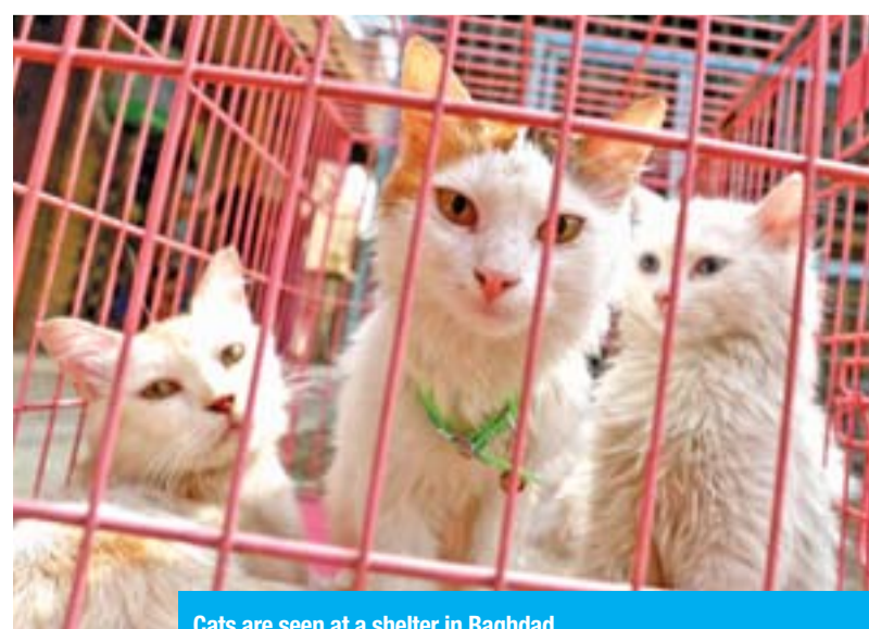
Cats are seen at a shelter in Baghdad.