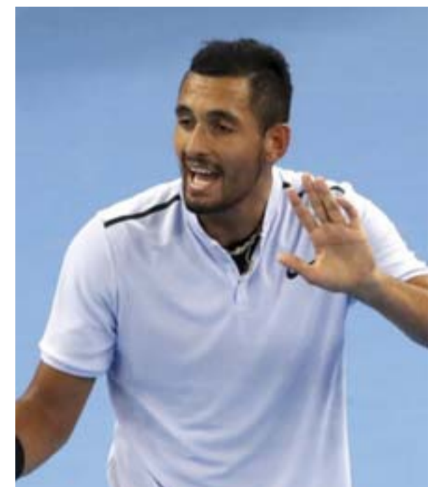
BEIJING: Nick Kyrgios of Australia during his men's singles championship match.

"I've been battling a stomach bug for the past 24 hours and I tried to be ready but I was really struggling on the court today which I think was pretty evident from the first point," he wrote. "My shoulder started to hurt in the practice today which didn't help either and once I lost the first set I was just not strong enough to continue because I've not eaten much the past 24 hours." The ATP said it was investigating. Kyrgios added he would decide today whether to play his scheduled doubles. Last year, Kyrgios was suspended by the men's tour for tanking a match and insulting fans following a second-round loss to German qualifier Mischa Zverev at the Shanghai Masters. Kyrgios gave little effort during the 6-3, 6-1 loss, even patting easy serves over the net and turning away before his oppo-