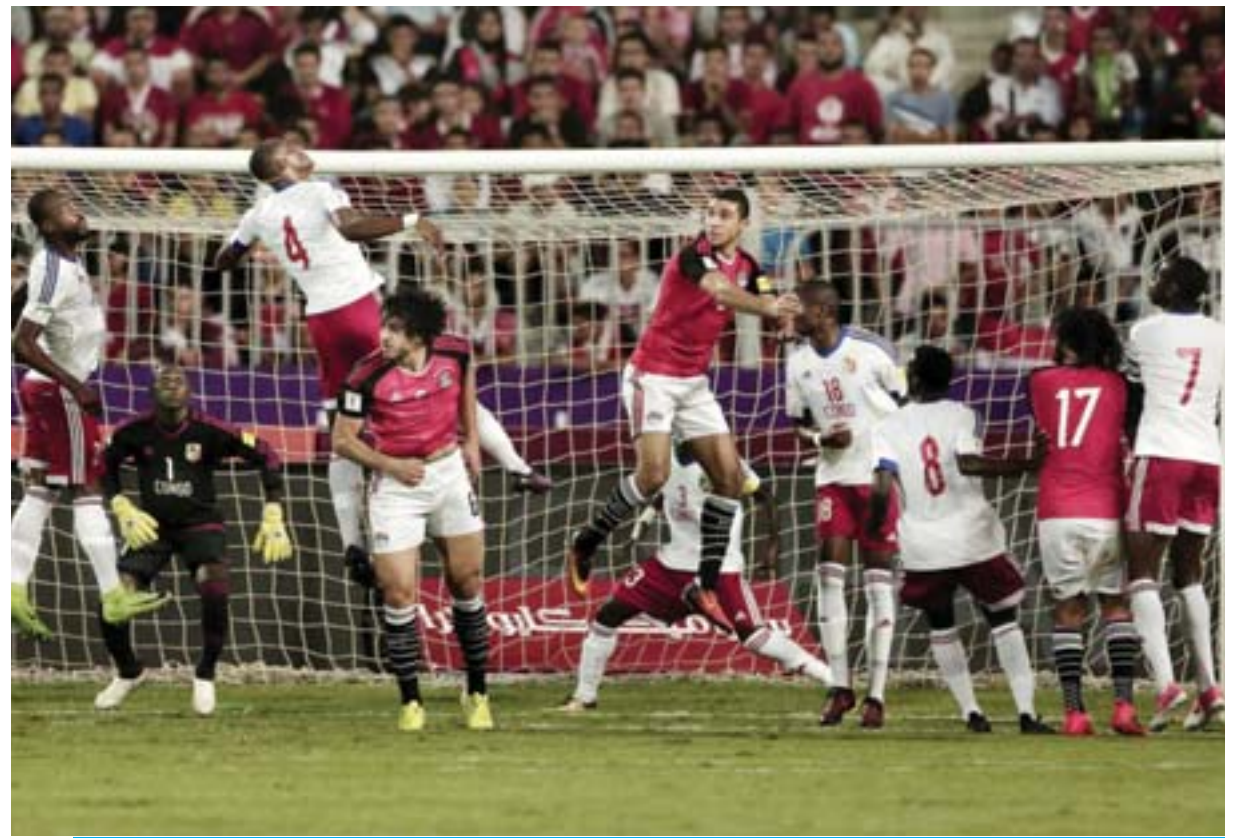
ALEXANDRIA: File photo shows Egypt and Congo players fight for the ball during the 2018 World Cup group E qualifying soccer match at the Borg El Arab Stadium in Alexandria.