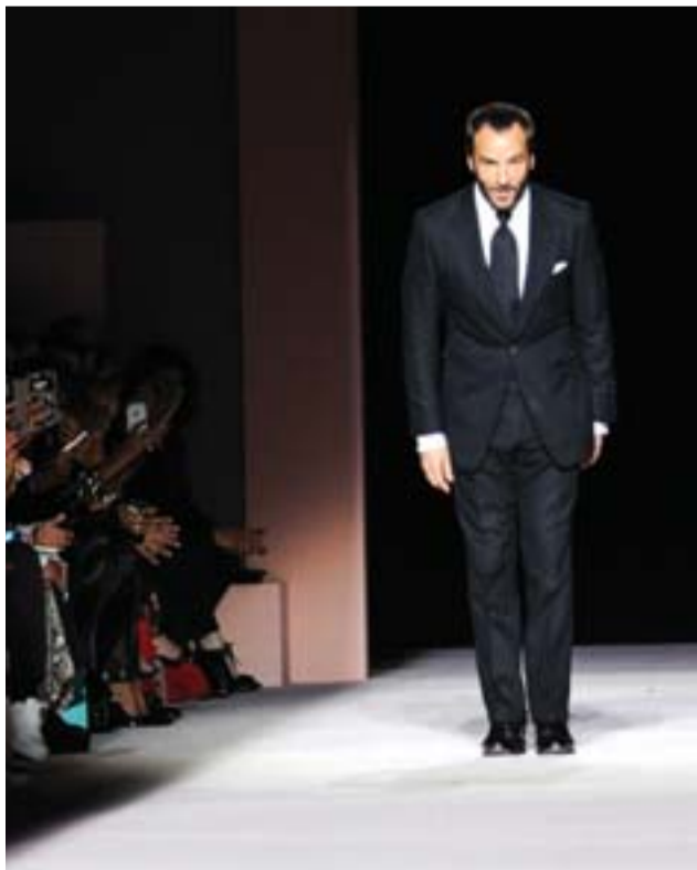
Designer Tom Ford greets the audience after his Spring 2018 collection is shown during New York Fashion Week, Wednesday.