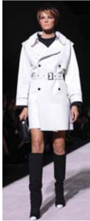
The Tom Ford Spring 2018 collection is modeled during New York Fashion Week, Wednesday.