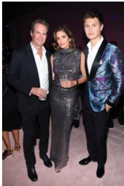
Rande Gerber, Cindy Crawford and Ansel Elgort attend the Tom Ford Spring/Summer 2018 Runway Show After Party.