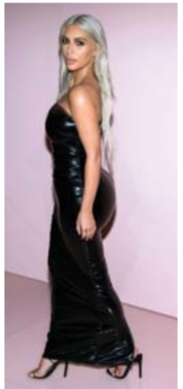
Kim Kardashian attends the Tom Ford show.