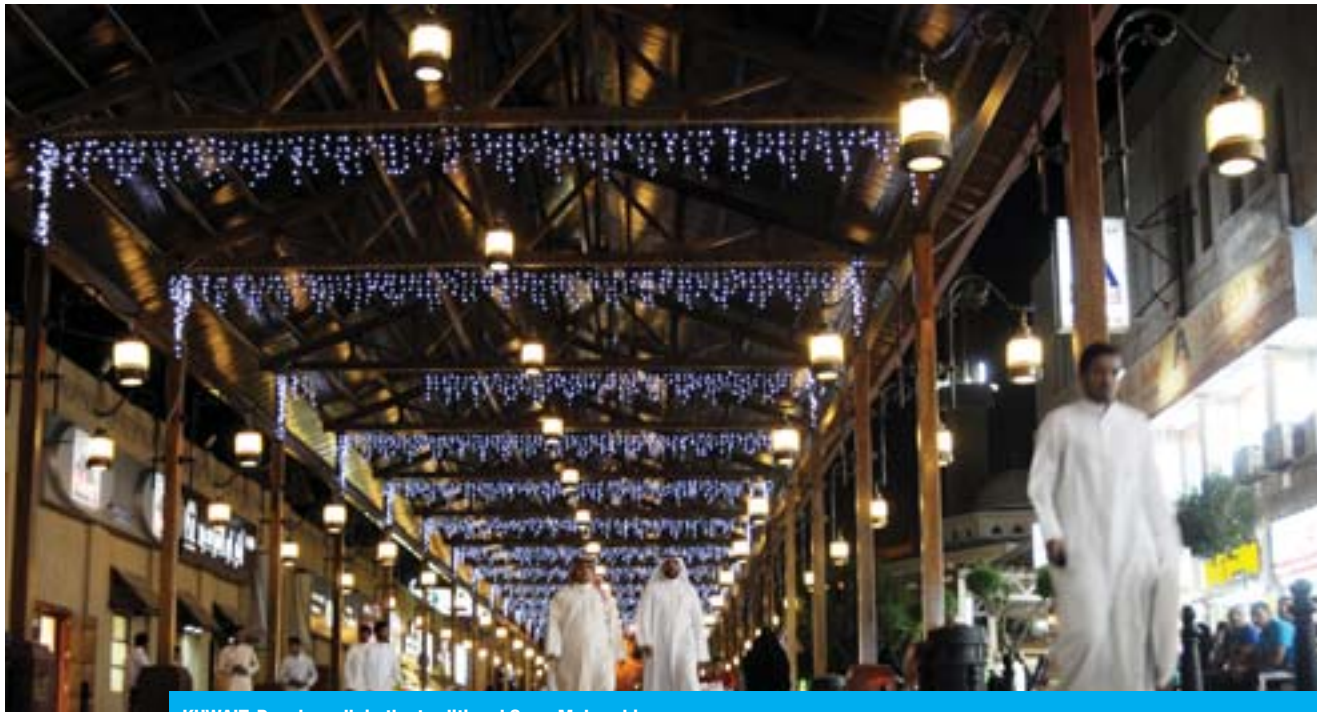
KUWAIT: People walk in the traditional Souq Mubarakiya.