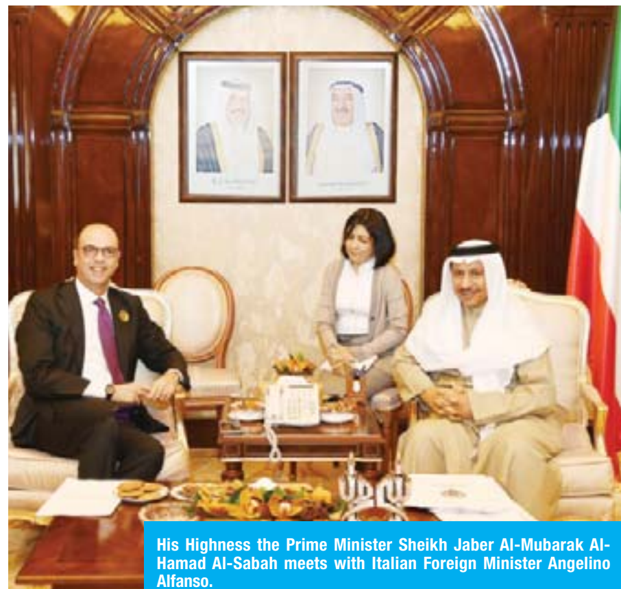
His Highness the Prime Minister Sheikh Jaber Al-Mubarak Al-Hamad Al-Sabah meets with Italian Foreign Minister Angelino Alfano.