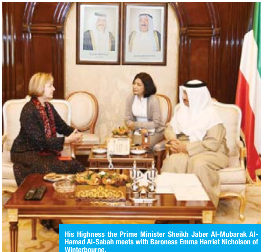
His Highness the Prime Minister Sheikh Jaber Al-Mubarak Al-Hamad Al-Sabah meets with Baroness Emma Harriet Nicholson of Winterbourne.