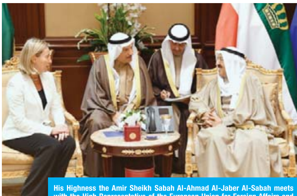
His Highness the Amir Sheikh Sabah Al-Ahmad Al-Jaber Al-Sabah meets with the High Representative of the European Union for Foreign Affairs and Security Policy Federica Mogherini.

His Highness the Amir expressed his hope that the victory would achieve support for Iraq and its people, and contribute to unifying their ranks. His Highness the Amir stressed Kuwait's backing to Iraq and Iraqis, which is manifested through holding the International Conference for the Reconstruction of Iraq. His Highness the