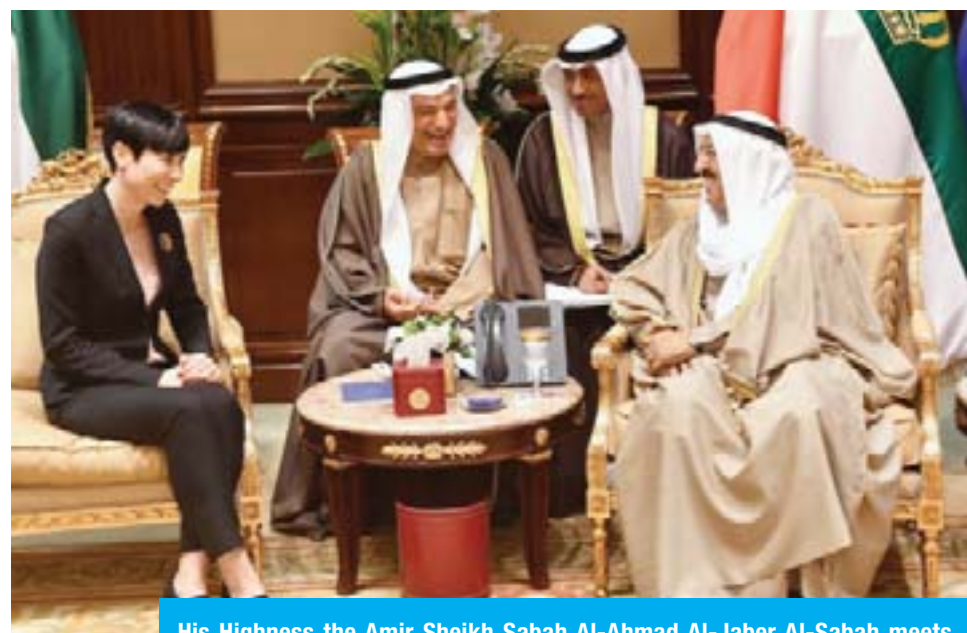
His Highness the Amir Sheikh Sabah Al-Ahmad Al-Jaber Al-Sabah meets with Norwegian Minister of Foreign Affairs Marie Eriksen Soreide.

Amir voiced his hope that stability and peace would prevail in Iraq and the region.