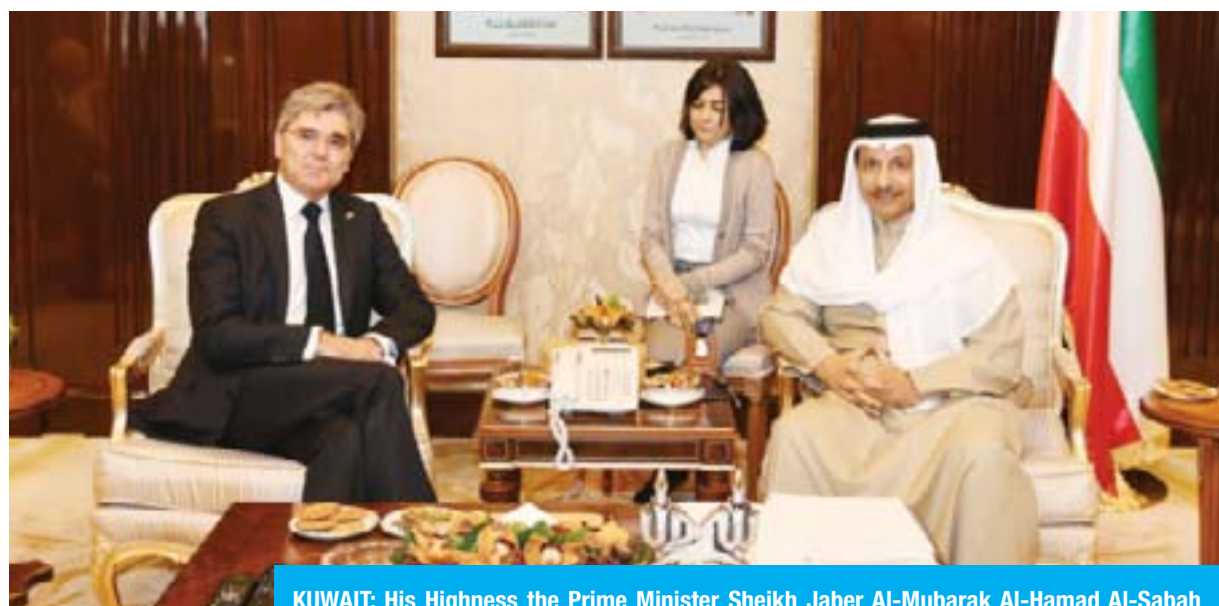
KUWAIT: His Highness the Prime Minister Sheikh Jaber Al-Mubarak Al-Hamad Al-Sabah meets with Chief Executive Officer of Siemens AG Joe Kaeser.