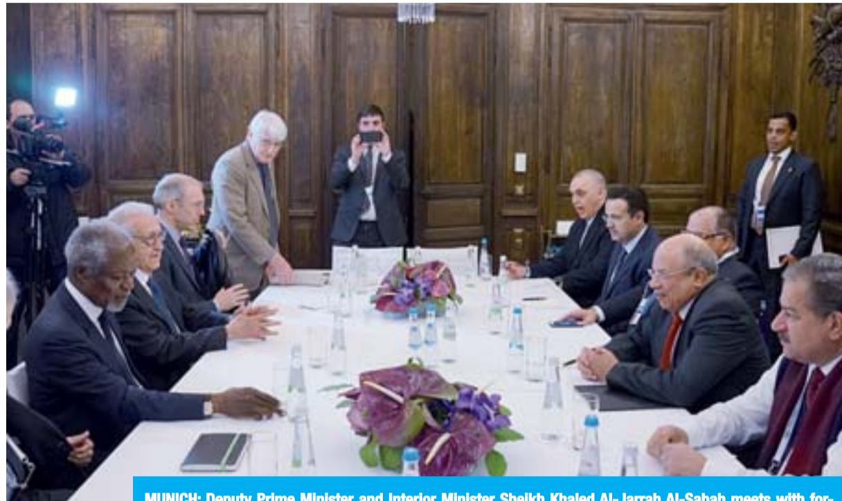
MUNICH: Deputy Prime Minister and Interior Minister Sheikh Khaled Al-Jarrah Al-Sabah meets with former UN chief Kofi Annan and former UN envoy for Syria Lakhdar Brahimi.

Sheikh Khaled Al-Jarrah participates in Munich Security Conference