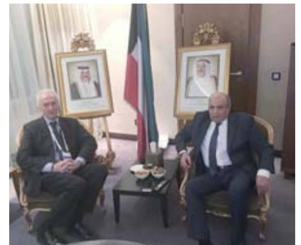
Deputy Prime Minister and Interior Minister Sheikh Khaled Al-Jarrah Al-Sabah meets with European Union (EU) Counter Terrorism Coordinator Gilles de Kerchove.

Furthermore, Sheikh Khaled Al-Jarrah held a meeting with Prime Minister of the Kurdistan Regional Government of Iraq Nechirvan Barzani. The two officials discussed means of bilateral relations. Then