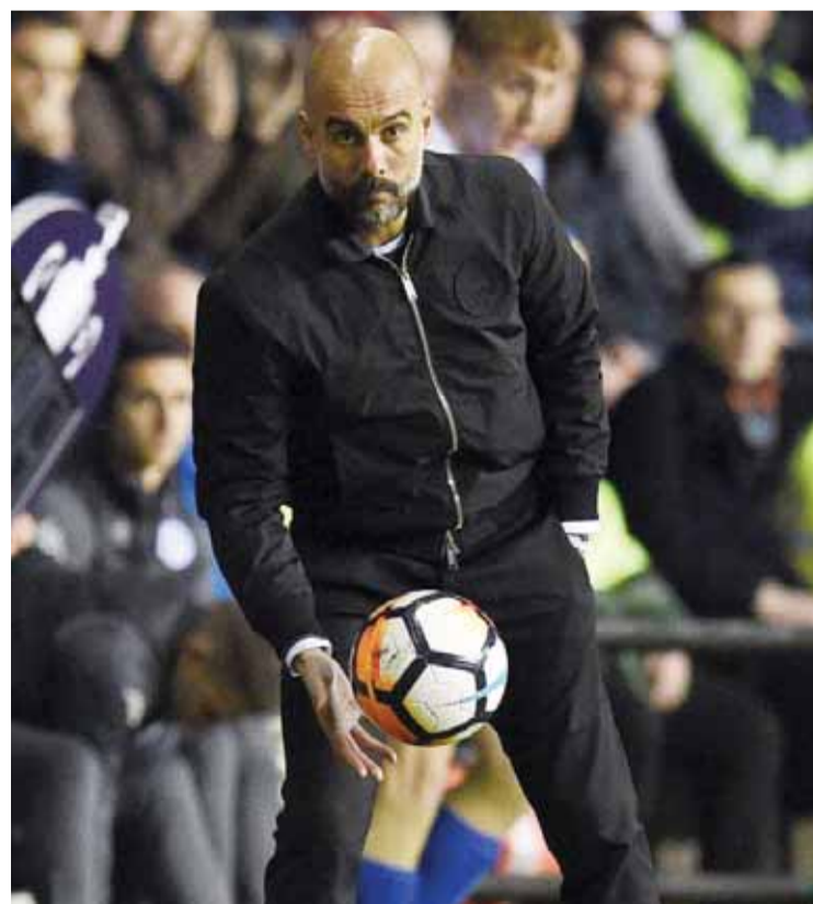
WIGAN: Manchester City's Spanish manager Pep Guardiola gestures during the English FA Cup fifth round football match between Wigan Athletic and Manchester City at the DW Stadium in Wigan.

Wenger has won the FA Cup a record seven times since he took the helm at Arsenal but has twice been beaten in the final of the League Cup, by Chelsea in 2007 and Birmingham City in 2011. The French manager was asked at his pre-match press conference what the key was to beating City. "To first of all have a strong belief that we can do it, be well-organized and take every opportunity to go forward and