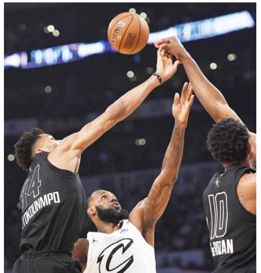
CALIFORNIA: Giannis Antetokounmpo of Team Stephen scraps for the ball during the NBA All-Star Game 2018 at Staples Center in Los Angeles, California.

Thaddeus Young scored 20 points and Victor Oladipo showed off his playmaking abilities on an off-shooting night as Indiana hammered visiting Atlanta. Oladipo hit just five of 16 shots for 14 points, but made an impact all over the court. The All-Star finished with nine assists, seven rebounds and four steals. Domantas Sabonis came off the bench to score 21 points and grab 13 rebounds, and Lance Stephenson added 13 points, eight rebounds and eight assists for the Pacers, who have won four in a row and 10 of their last 13. Isaiah Taylor scored 17