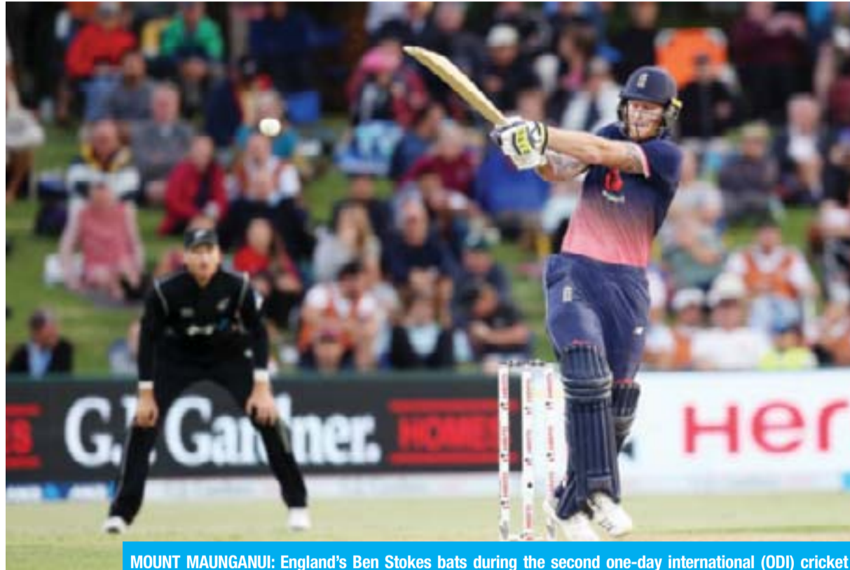
MOUNT MAUNGANUI: England's Ben Stokes bats during the second one-day international (ODI) cricket match between New Zealand and England at the Bay Oval in Mount Maunganui yesterday.

Stokes took two wickets for 42 then hit an unbeaten 63 as England easily chased down New Zealand's target of 224 at Mount Maunganui. "It was good to get a bit of time out in the middle," he said after England levelled the five-match series 1-1.