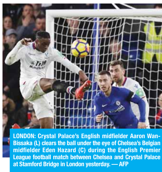
LONDON: Crystal Palace's English midfielder Aaron Wan-Bissaka (L) clears the ball under the eye of Chelsea's Belgian midfielder Eden Hazard (C) during the English Premier League football match between Chelsea and Crystal Palace at Stamford Bridge in London yesterday.

Fifth-placed Chelsea moved to within four points of Liverpool, two behind Tottenham Hotspur - who play Bournemouth on Sunday - in fourth, after a nervy 2-1 win over Crystal Palace in the late kickoff.—Agencies