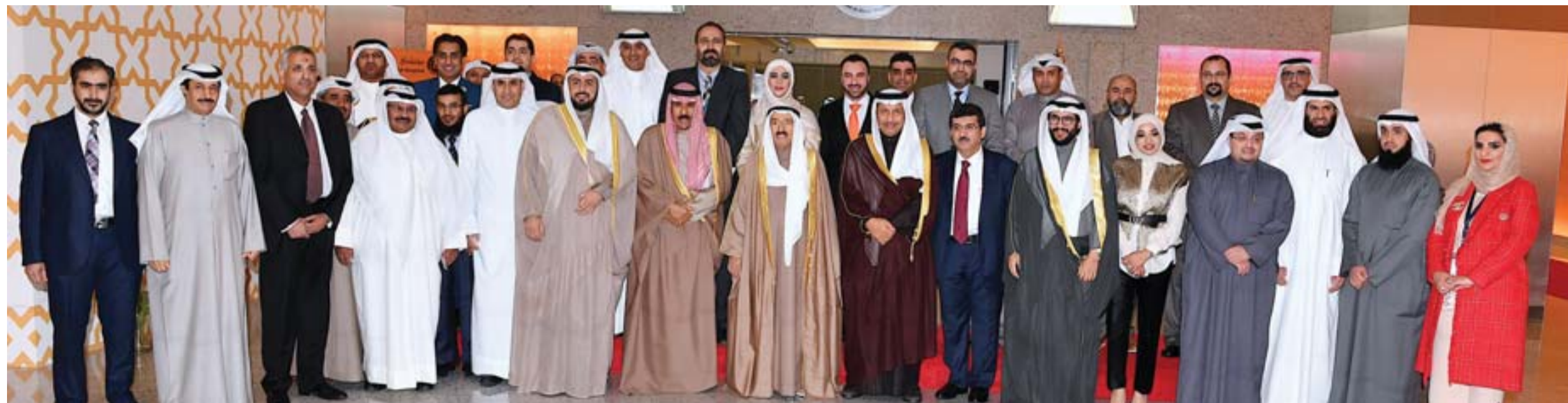
KUWAIT: His Highness the Amir Sheikh Sabah Al-Ahmad Al-Jaber Al-Sabah, His Highness the Crown Prince Sheikh Nawaf Al-Ahmad Al-Jaber Al-Sabah, His Highness the Prime Minister Sheikh Jaber Al-Mubarak Al-Hamad Al-Sabah, and Minister of Health Sheikh Dr Basel Humoud Al-Sabah pose with officials at the Sheikh Jaber Al-Ahmad Hospital yesterday.

Largest in the Middle East and sixth largest in the world