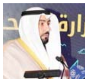
Minister of Health Sheikh Dr Basel Humoud Al-Sabah

Considered the largest in the Middle East and the sixth largest in the world, the Sheikh Jaber Al-Ahmad Hospital was built on an overall area of 725,000 square meters, and includes a bed capacity of 1,168 with 36 operation rooms, a medical center, a helipad, and a parking lot accommodating some 5,000 vehicles. The hospital, which starts receiving citizens next week, adds to the total bed capacity of medical facilities in Kuwait to reach over 160,000. The government considers the hospital's inauguration a major achievement under the 'New Kuwait' vision for 2035 in terms of providing quality health care to Kuwaiti citizens. — KUNA