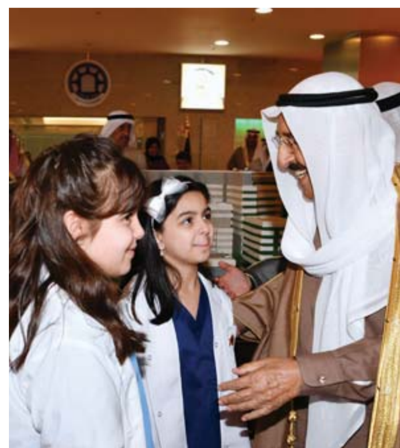
Children greet His Highness the Amir Sheikh Sabah Al-Ahmad Al-Jaber Al-Sabah during the ceremony.