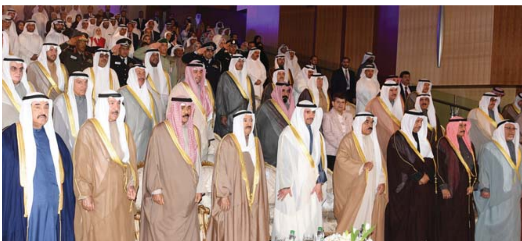
His Highness the Amir Sheikh Sabah Al-Ahmad Al-Jaber Al-Sabah and top state officials attend the inauguration of the Sheikh Jaber Al-Ahmad Hospital.