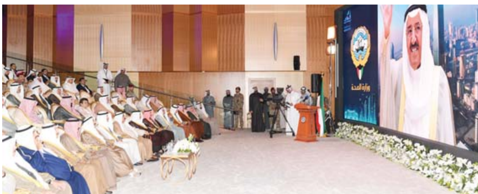
Officials watch a presentation depicting the different stages of the hospital's construction.