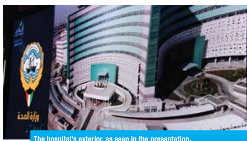
The hospital's exterior, as seen in the presentation.