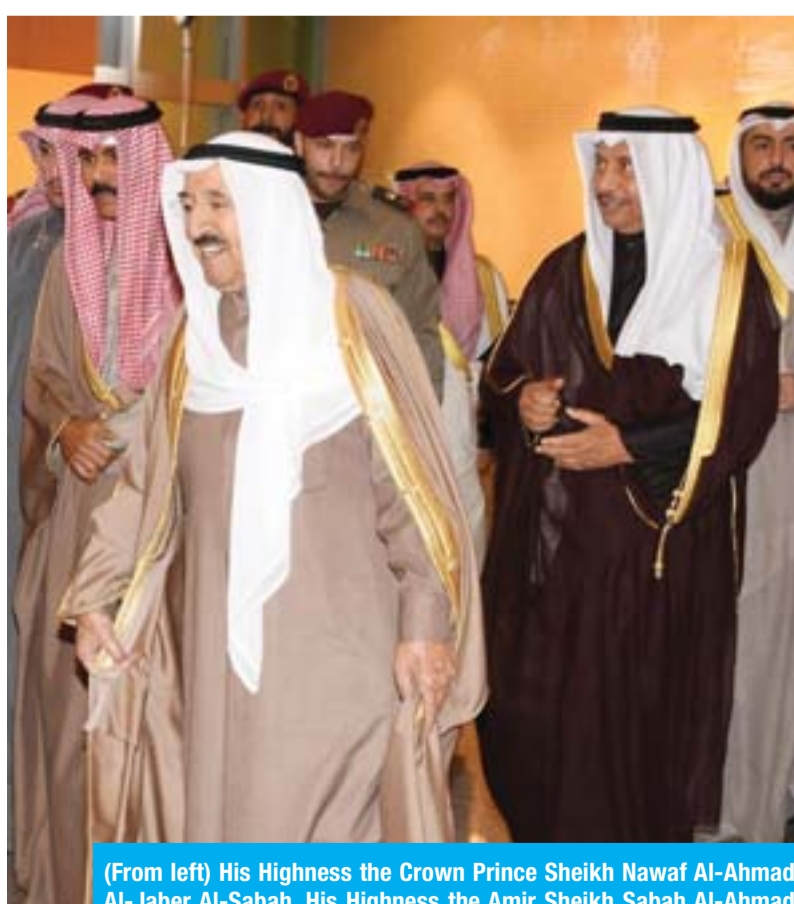
(From left) His Highness the Crown Prince Sheikh Nawaf Al-Ahmad Al-Jaber Al-Sabah, His Highness the Amir Sheikh Sabah Al-Ahmad Al-Jaber Al-Sabah, His Highness the Prime Minister Sheikh Jaber Al-Mubarak Al-Hamad Al-Sabah, and Minister of Health Sheikh Dr Basel Humoud Al-Sabah enter the venue.