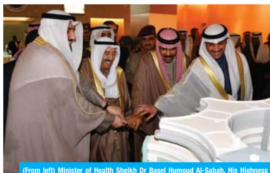
(From left) Minister of Health Sheikh Dr Basel Humoud Al-Sabah, His Highness the Amir Sheikh Sabah Al-Ahmad Al-Jaber Al-Sabah, His Highness the Crown Prince Sheikh Nawaf Al-Ahmad Al-Jaber Al-Sabah, and National Assembly Speaker Marzouq Al-Ghanem cut the cake during the ceremony.