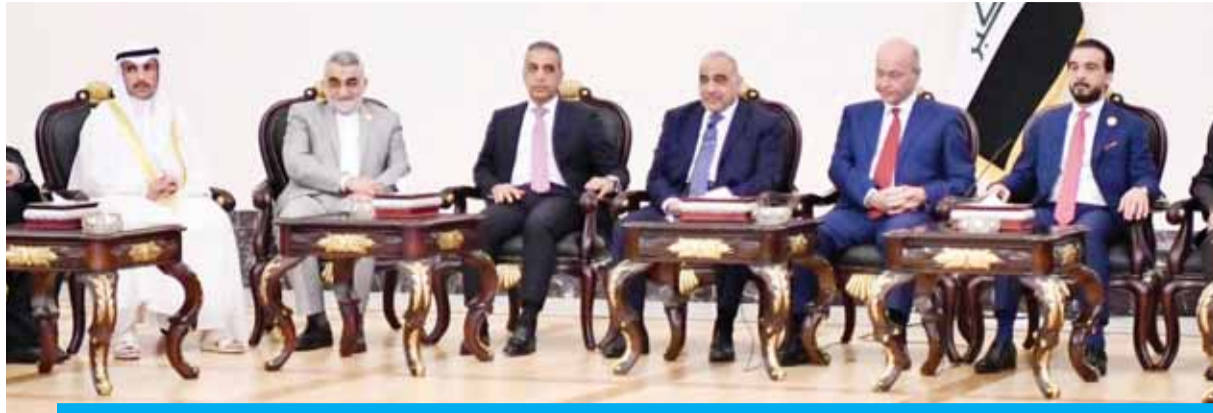
BAGHDAD: Iraqi President Barham Saleh meets with the leading parliamentarians of Iraq's neighbors, including Kuwaiti National Assembly Speaker Marzouq Al-Ghanem.