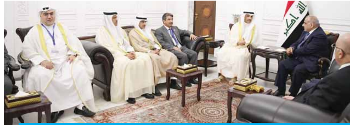
Kuwaiti National Assembly Speaker Marzouq Al-Ghanem meets with Iraqi Prime Minister Adel Abdulmehti.