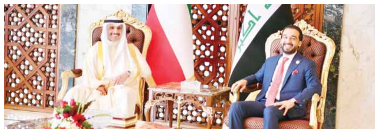
National Assembly Speaker Marzouq Al-Ghanem meets with his Iraqi counterpart Mohammad Al-Halbousi shortly after arriving in Baghdad yesterday.