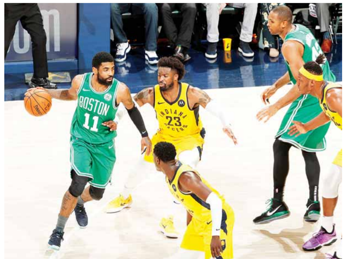
INDIANAPOLIS: Kyrie Irving #11 of the Boston Celtics handles the ball against the Indiana Pacers during Game Three of Round One of the 2019 NBA Playoffs on April 19, 2019 at Bankers Life Fieldhouse in Indianapolis, Indiana.

Pascal Siakam scored a playoff-career-best 30