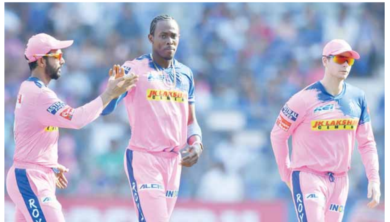
MUMBAI: File photo shows Rajasthan Royals bowler Jofra Archer (C) celebrates with captain Ajinkya Rahane (L) and Steven Smith after taking the wicket of Mumbai Indians captain Rohit Sharma during the 2019 Indian Premier League (IPL) Twenty20 cricket match between Mumbai Indians and Rajasthan Royals in Mumbai on April 13, 2019.

"Moeen said 'I am going to go now' and I asked him