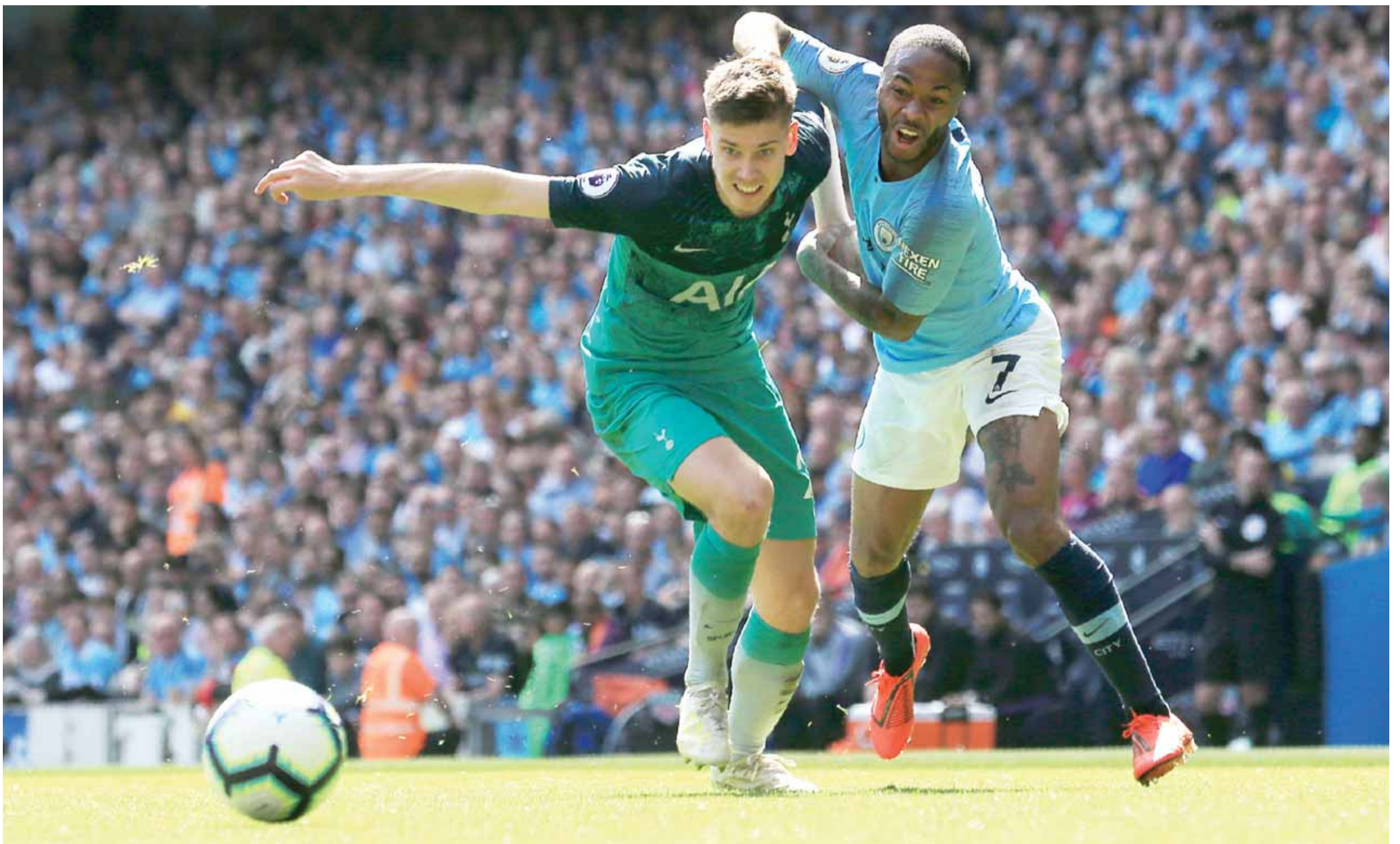
MANCHESTER: Tottenham Hotspur's Argentinian defender Juan Foyth (L) vies with Manchester City's English midfielder Raheem Sterling during the English Premier League football match between Manchester City and Tottenham Hotspur at the Etihad Stadium in Manchester, north west England, yesterday.