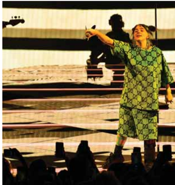
In this file photo singer Billie Eilish performs onstage at the Greek Theatre in Los Angeles, California.