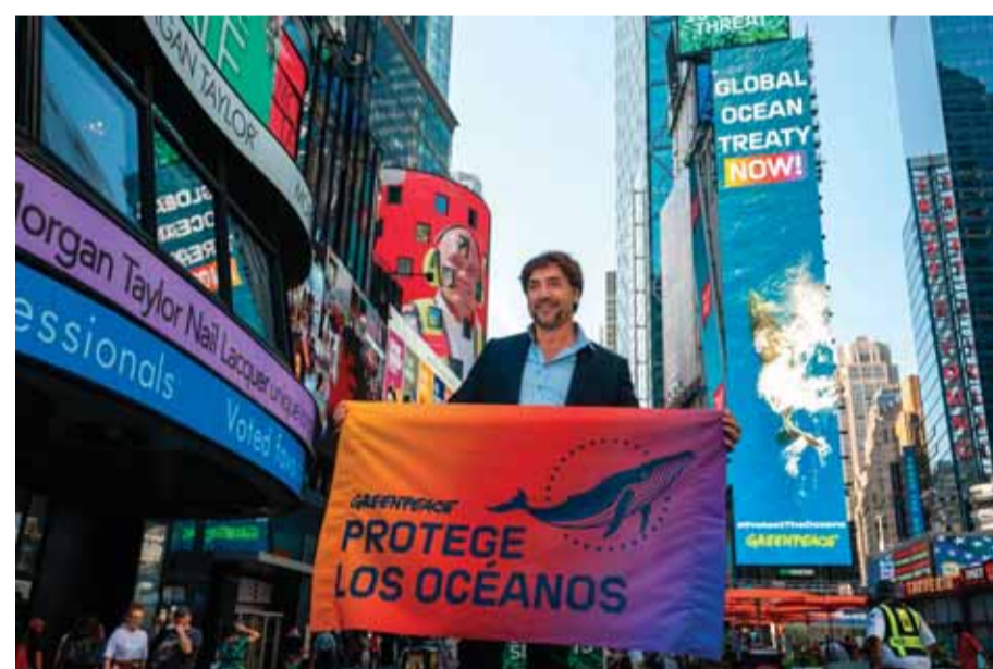
Actor Javier Bardem holds a banner for Greenpeace as he poses for photos in Times in New York.

While much reporting by the British press on the royal family is respectful, verging on the sycophantic, at other times it can be harshly critical, even cruel. The couple have not publicly responded to the various attacks on them, but took to Instagram to post a message of positivity. "Do your little bit of good where you are; it's those little bits of good put together that overwhelm the world," the post said, quoting anti-apartheid activist Desmond Tutu. But that too was swiftly criticized. "Your little bit of good might be flying on commercial rather than always private," user Dale Strickland commented. "Remember that footprint you both talk about." — Reuters