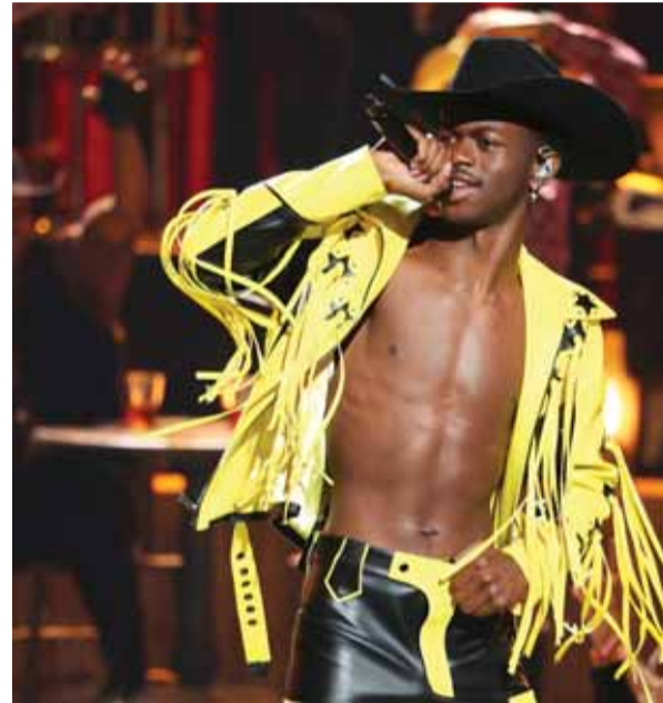
In this file photo Lil Nas X performs onstage during the 2019 BET awards at Microsoft Theater in Los Angeles, California.