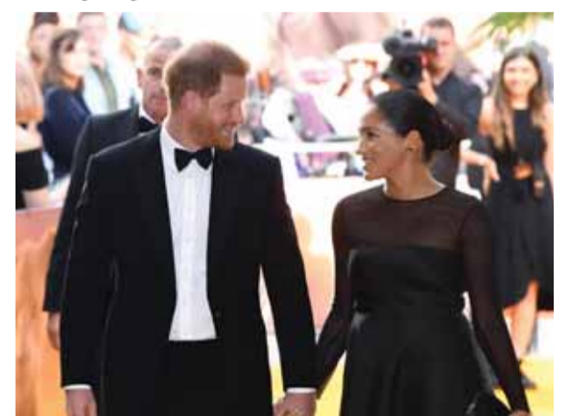
Prince Harry and Meghan

the world better," she wrote. Harry and Meghan's wedding in May 2018 was marked by an outpouring of affection in Britain but less than a year later the couple have found themselves on the receiving end of a barrage of negative stories in the media. They have ranged from the $3 million cost of renovating their new home to reports dubbing Meghan "Duchess Difficult."