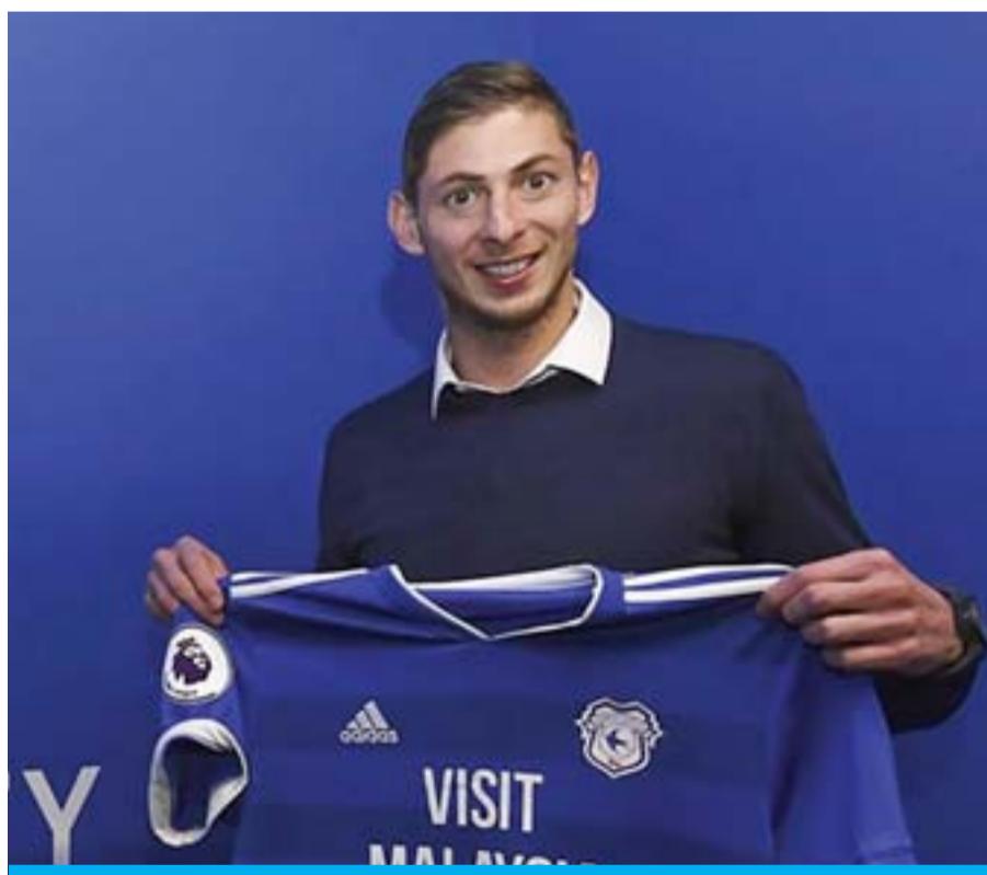
CARDIFF: File photo released by Cardiff City FC via Noticias Argentinas taken on January 20, 2019 showing Argentine footballer Emiliano Sala posing with Cardiff's jersey after signing for the club, in Cardiff, UK.