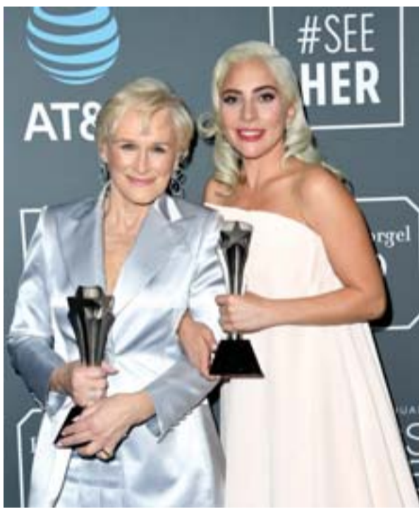
Glenn Close (left), winner of Best Actress for 'The Wife', and Lady Gaga, winner of Best Actress for 'A Star Is Born,' pose in the press room.

Hollywood's award season was in full swing late Sunday, with Alfonso Cuarón's "Roma" - an ode to the director's childhood in 1970s Mexico City - the big winner at the Critics' Choice Awards. "Roma" won trophies for best picture, best foreign-language film, and for both director and cinematography for Cuarón. "This bunch of Mexicans are not as bad as sometimes they are portrayed," said Cuarón, a reference to President Donald Trump's hardline rhetoric on immigration. Shot in black and white, and filmed in Spanish and the indigenous Mixtec language, "Roma" is a semi-autobiographical chronicle of a year in the life of Cuarón's family and his childhood nanny. "Roma" - the title a reference to a posh Mexico City neighborhood-earlier won two Golden Globes and is a leading contender for an Oscar at the Academy Awards ceremony in February. Christian Bale, who portrayed former US vice president Dick Cheney in "Vice," won awards in the Best Actor and Best Actor in a Comedy categories, while Glenn Close ("The Wife") and Lady Gaga ("A Star is Born") jointly won in the Best Actress category. Mahershala Ali ("Green Book") walked away with a Best Supporting Actor win, while Regina King ("If Beale Street Could Talk") won for Best Supporting Actress.