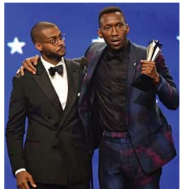
Mahershala Ali (right) accepts the award for Best Supporting Actor with Kris Bowers onstage during the 24th annual Critics' Choice Awards.

Seen as a barometer for the Oscars, the Critics' Choice Awards also includes prizes for the best of television. "The Americans" took the award for Best Drama Series, while "The Marvelous Mrs. Maisel" took the Best Comedy Series award, with its star Rachel Brosnahan winning in the Best Actress in a Comedy Series category. The annual event is held by the Broadcast Film Critics Association and the Broadcast Television Journalists Association. The Sunday show was hosted by actor Taye Diggs.