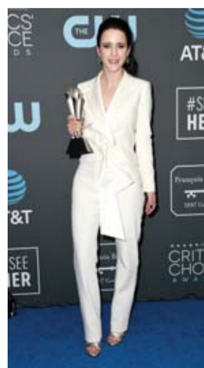
Rachel Brosnahan, winner of Best Actress for 'The Marvelous Mrs. Maisel.'