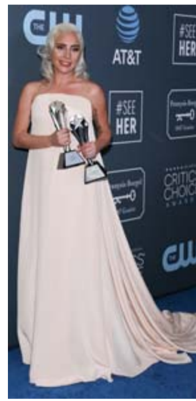
Best actress and Best Song winner Lady Gaga pose in the press room.