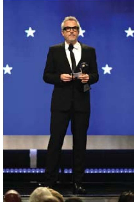
Alfonso Cuaron accepts the award for Best Director onstage during the 24th annual Critics' Choice Awards.