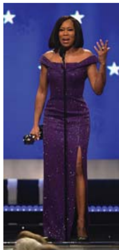
Regina King accepts the award for Best Supporting Actress (Film).

Offbeat 18th century royal romp "The Favorite," which entered the ceremony with 14 nominations, won the award for Best Acting Ensemble, while its star Olivia Colman won the Best Actress in a Comedy award. "Spider-Man: Into the Spider-Verse" won the Best Animated Feature award, beating out stiff competition from Pixar-Disney's "The Incredibles 2," Disney's "Ralph Breaks the Internet," and