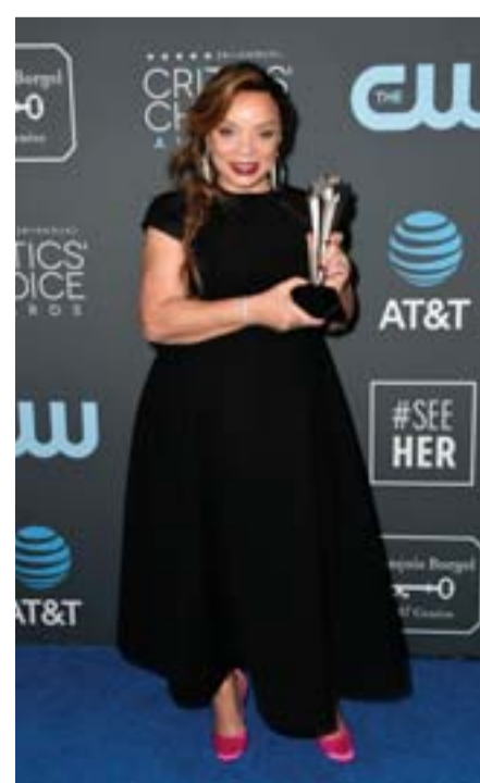
Ruth E Carter, winner of Best Costume Design for 'Black Panther.'