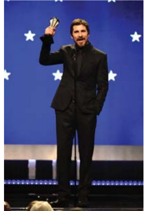
Christian Bale accepts the award for Best Actor In A Movie onstage.