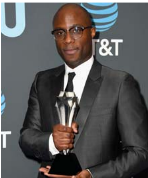
Barry Jenkins, winner of Best Adapted Screenplay for 'If Beale Street Could Talk'.