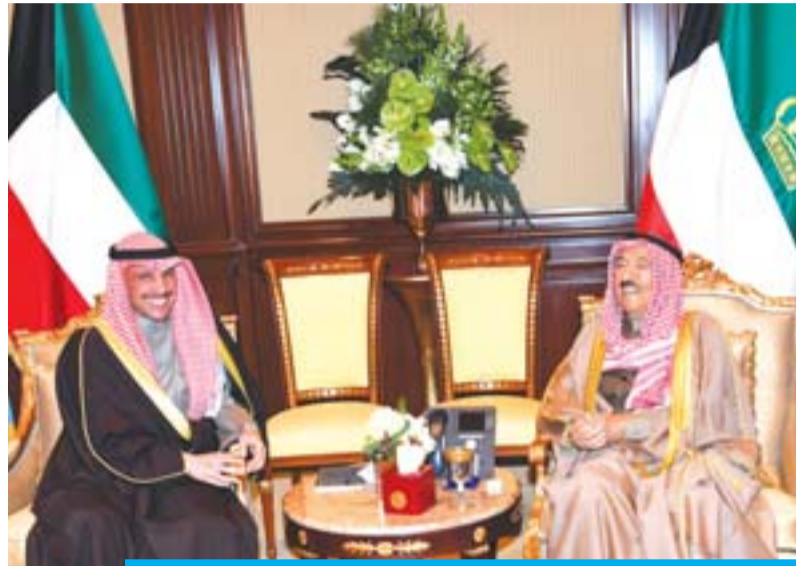
His Highness the Amir Sheikh Sabah Al-Ahmad Al-Jaber Al-Sabah meets with National Assembly Speaker Marzouq Al-Ghanem.