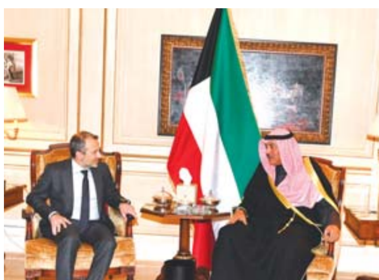
Deputy Prime Minister and Foreign Minister Sheikh Sabah Al-Khaled Al-Sabah meets with Lebanon's Minister of Foreign Affairs and Emigrants Gebran Bassil.