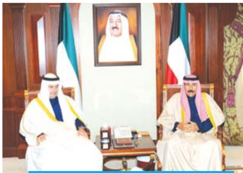
His Highness the Crown Prince Sheikh Nawaf Al-Ahmad Al-Jaber Al-Sabah meets with Deputy Prime Minister and State Minister for Cabinet Affairs Anas Al-Saleh.

In addition, His Highness the Amir sent a cable of condolences to the member of supreme council and ruler of Ajman in the UAE Sheikh Hameed bin Rashed Al-Nuaimi over the demise of his sister Sheikhha Naela bin Rashed Al-Nuaimi. In his cable, His Highness the Amir prayed to God Almighty to bestow mercy upon the dead and bring solace to his brother Sheikh Hameed and his family. His Highness the Crown Prince and His Highness the Prime Minister sent similar con-