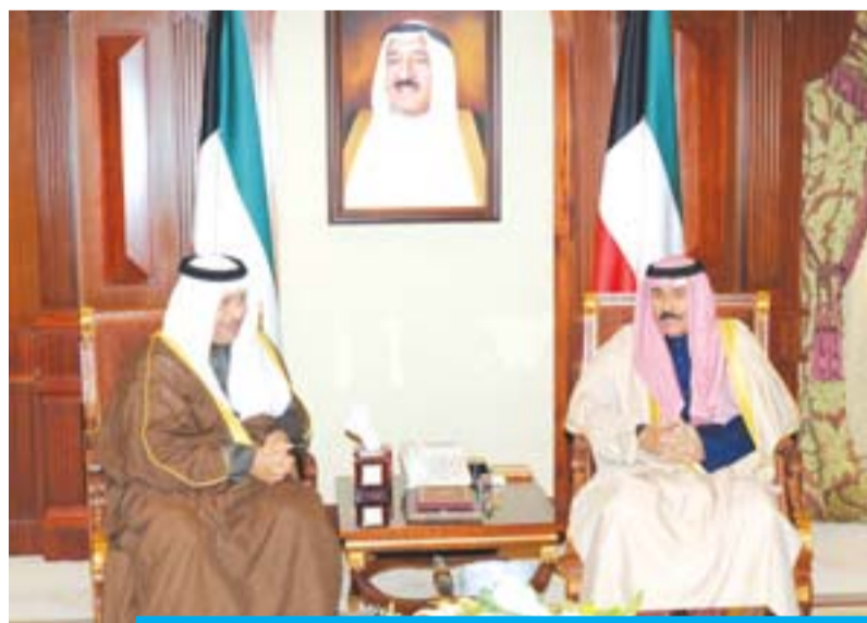
His Highness the Crown Prince Sheikh Nawaf Al-Ahmad Al-Jaber Al-Sabah meets with His Highness the Prime Minister Sheikh Jaber Al-Mubarak Al-Hamad Al-Sabah.