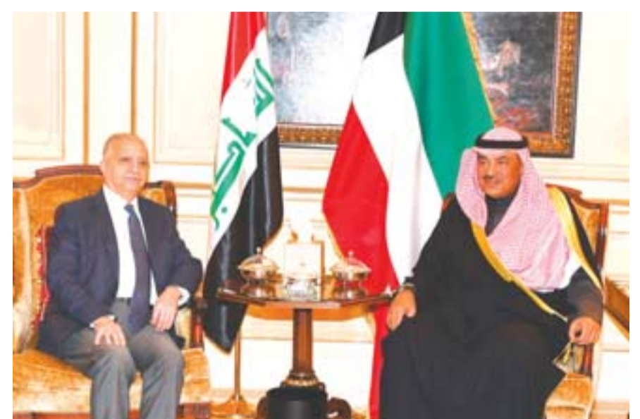
Deputy Prime Minister and Foreign Minister Sheikh Sabah Al-Khaled Al-Sabah meets with Iraq's Foreign Minister Mohamed Ali Al-Hakim.