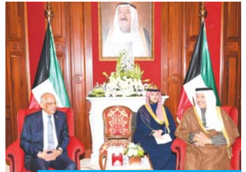
His Highness the Prime Minister Sheikh Jaber Al-Mubarak Al-Hamad Al-Sabah meets with Speaker of the Egyptian House of Representatives Dr Ali Abdelaal.