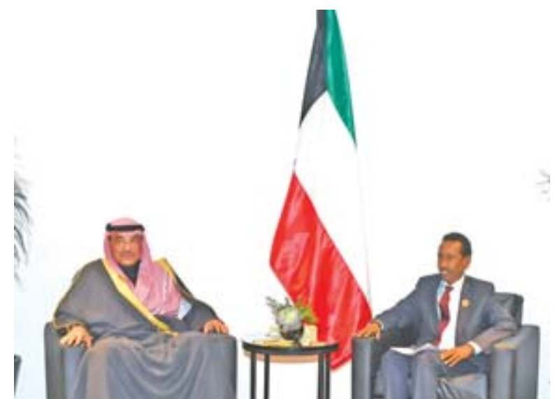
Deputy Prime Minister and Foreign Minister Sheikh Sabah Al-Khaled Al-Hamad Al-Sabah meets with Somali Foreign Minister Ahmad Essa Awad.