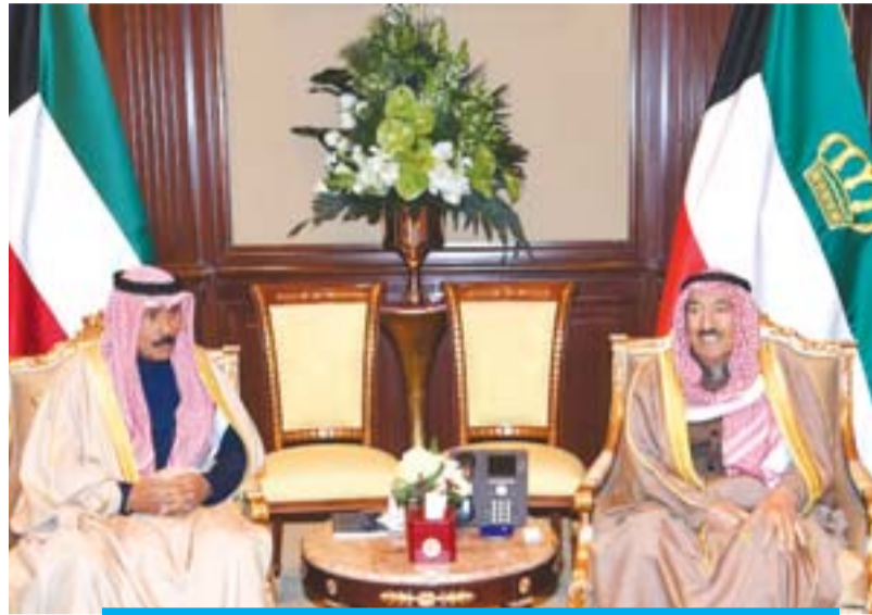
KUWAIT: His Highness the Amir Sheikh Sabah Al-Ahmad Al-Jaber Al-Sabah meets with His Highness the Crown Prince Sheikh Nawaf Al-Ahmad Al-Jaber Al-Sabah.

Sheikh Sabah sends condolences to Colombian, Mexican presidents, Ajman ruler