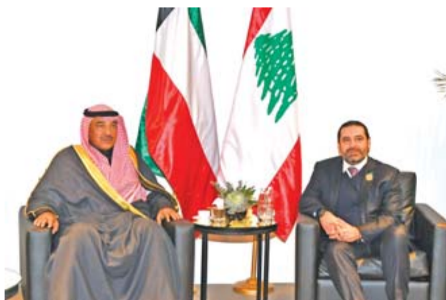
BEIRUT: Deputy Premier and Foreign Minister Sheikh Sabah Al-Khaled Al-Hamad Al-Sabah meets with Lebanese Premier-designate Saad Al-Hariri.