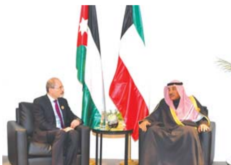
Deputy Prime Minister and Foreign Minister Sheikh Sabah Al-Khaled Al-Hamad Al-Sabah meets with Jordanian Minister of Foreign Affairs Ayman Safadi.