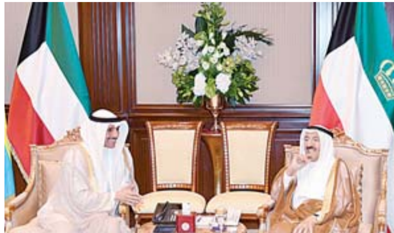
HH the Amir receives the National Assembly Speaker Marzouq Al-Ghanem.