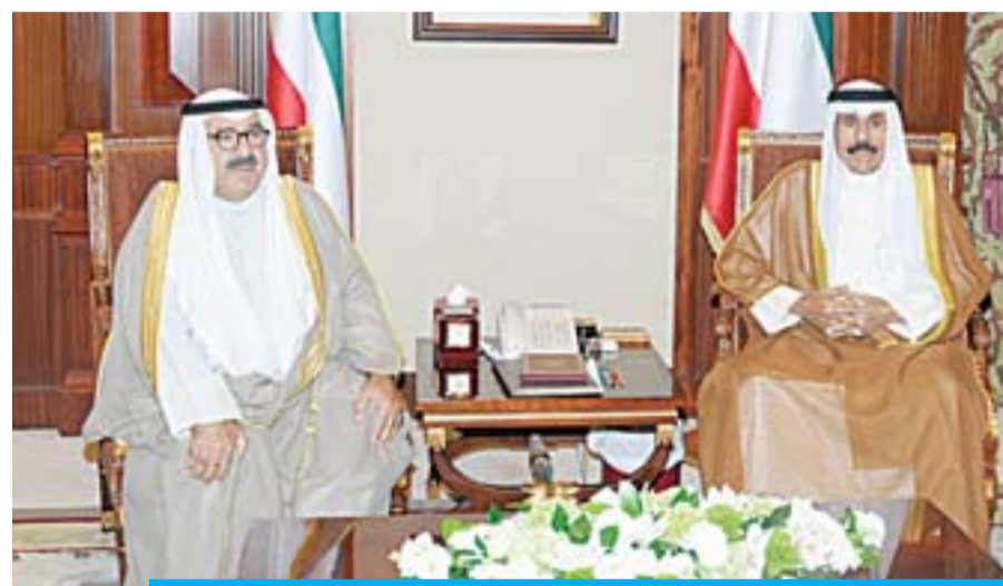
His Highness the Crown Prince receives the First Deputy Premier, Minister of Defense Sheikh Nasser Sabah Al-Ahmad Al-Sabah.