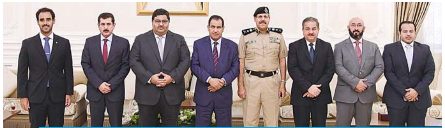
KUWAIT: The high-level Kuwaiti delegation departing to the UK.

KUWAIT: A high-level Kuwaiti delegation headed to the UK yesterday on a visit to view the recent developments in crisis management. The delegation, during its several-day visit, will be keen on discussing cooperation with the UK within the domain of crisis management and in ways to enhance cooperation between the two sides. The delegation includes officials from His Highness the Prime Minister's Diwan, the Kuwaiti Army, the Interior Ministry, Kuwait National Guard (KNG) and Kuwait Fire Service Directorate (KFSB).