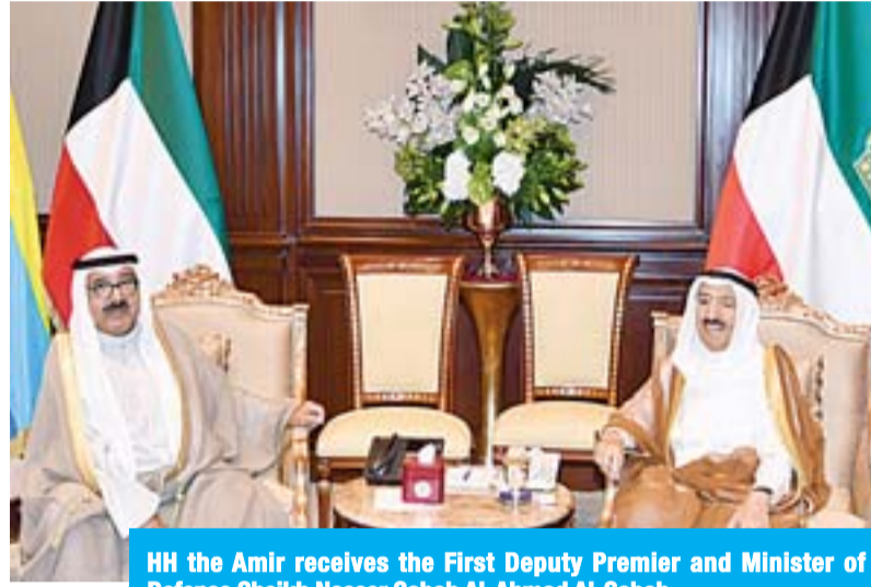
HH the Amir receives the First Deputy Premier and Minister of Defense Sheikh Nasser Sabah Al-Ahmad Al-Sabah.