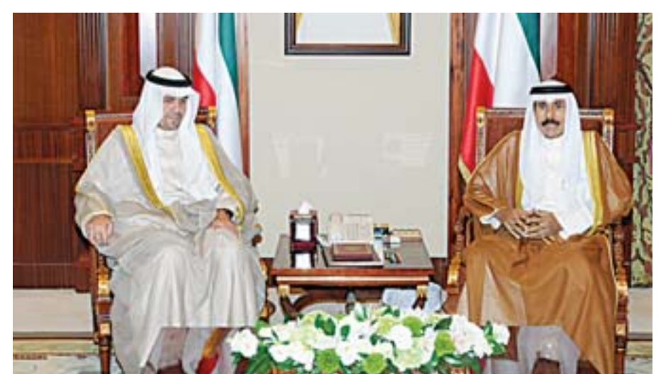
HH the Crown Prince receives His Highness the Deputy Premier, Minister of State for Cabinet Affairs Anas Al-Saleh.