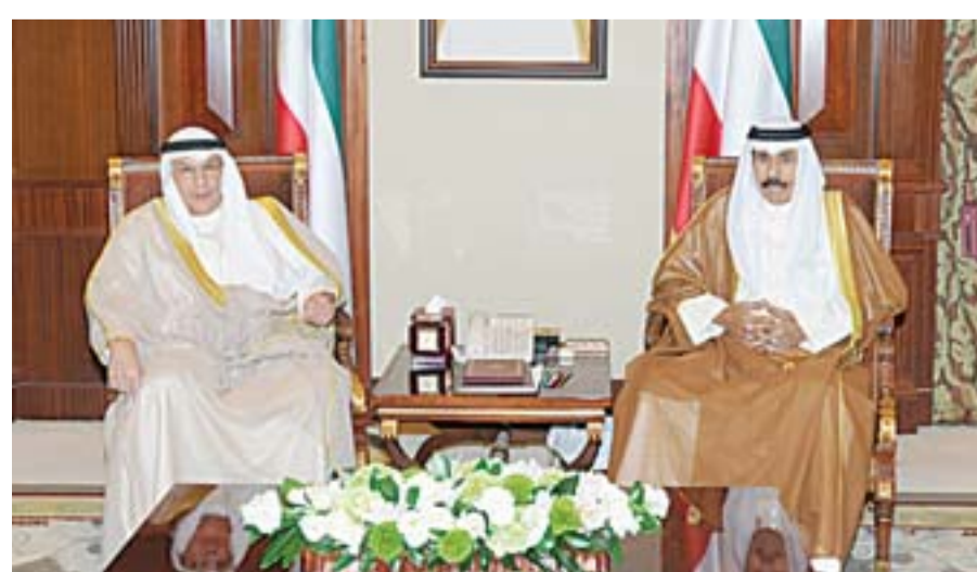
His Highness the Crown Prince receives the Deputy Premier, Interior Minister Sheikh Khaled Al-Jarrah Al-Sabah.