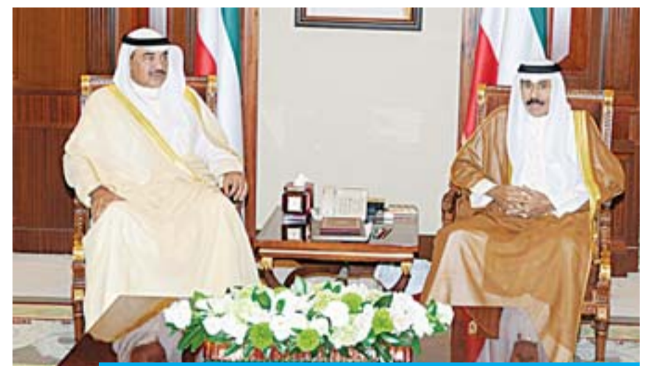
His Highness the Crown Prince receives the Deputy Premier, Minister of Foreign Affairs Sheikh Sabah Al-Khaled Al-Hamad Al-Sabah.