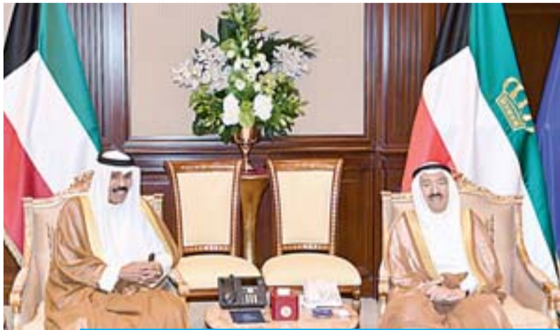
His Highness the Amir Sheikh Sabah Al-Ahmad Al-Jaber Al-Sabah receives HH the Crown Prince Sheikh Nawaf Al-Ahmad Al-Jaber Al-Sabah.