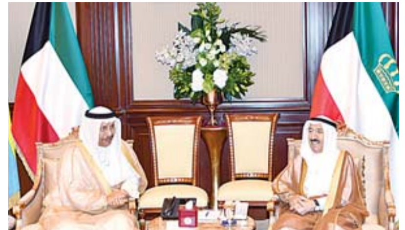
HH the Amir receives the HH Prime Minister Sheikh Jaber Al-Mubarak Al-Hamad Al-Sabah.