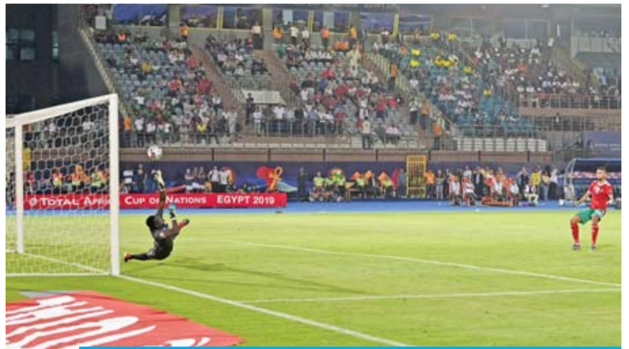
CAIRO: Morocco's forward Youssef En-Nesyri misses a penalty during the penalty shoot-out of the 2019 Africa Cup of Nations (CAN) Round of 16 football match between Morocco and Benin at the Al-Salam Stadium on July 5, 2019.

Meanwhile, Senegal forward Sadio Mane continued his