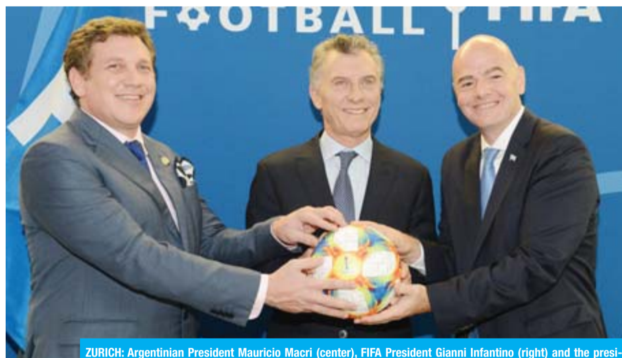
ZURICH: Argentinian President Mauricio Macri (center), FIFA President Gianni Infantino (right) and the president of the South American football's governing body Conmebol, Paraguayan Alejandro Dominguez pose with a ball in Zurich.

This is only the second women's World Cup since it was expanded from 16 teams to 24 in Canada four years ago. The competition started out with 12 teams in 1991. Infantino suggested FIFA may need to "reopen the bidding