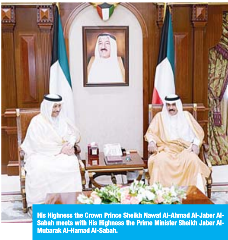
His Highness the Crown Prince Sheikh Nawaf Al-Ahmad Al-Jaber Al-Sabah meets with His Highness the Prime Minister Sheikh Jaber Al-Mubarak Al-Hamad Al-Sabah.