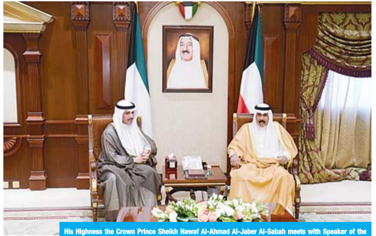
His Highness the Crown Prince Sheikh Nawaf Al-Ahmad Al-Jaber Al-Sabah meets with Speaker of the National Assembly Marzuq Al-Ghanem.