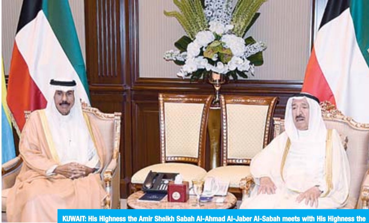
KUWAIT: His Highness the Amir Sheikh Sabah Al-Ahmad Al-Jaber Al-Sabah meets with His Highness the Crown Prince Sheikh Nawaf Al-Ahmad Al-Jaber Al-Sabah.