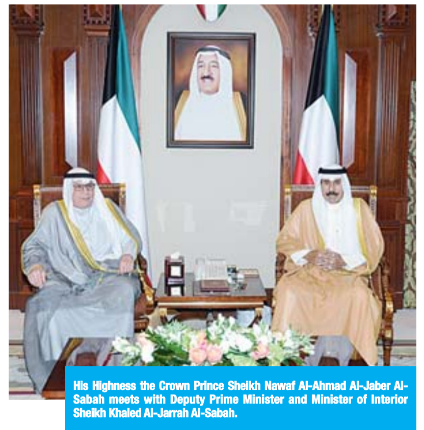
His Highness the Crown Prince Sheikh Nawaf Al-Ahmad Al-Jaber Al-Sabah meets with Deputy Prime Minister and Minister of Interior Sheikh Khaled Al-Jarrah Al-Sabah.