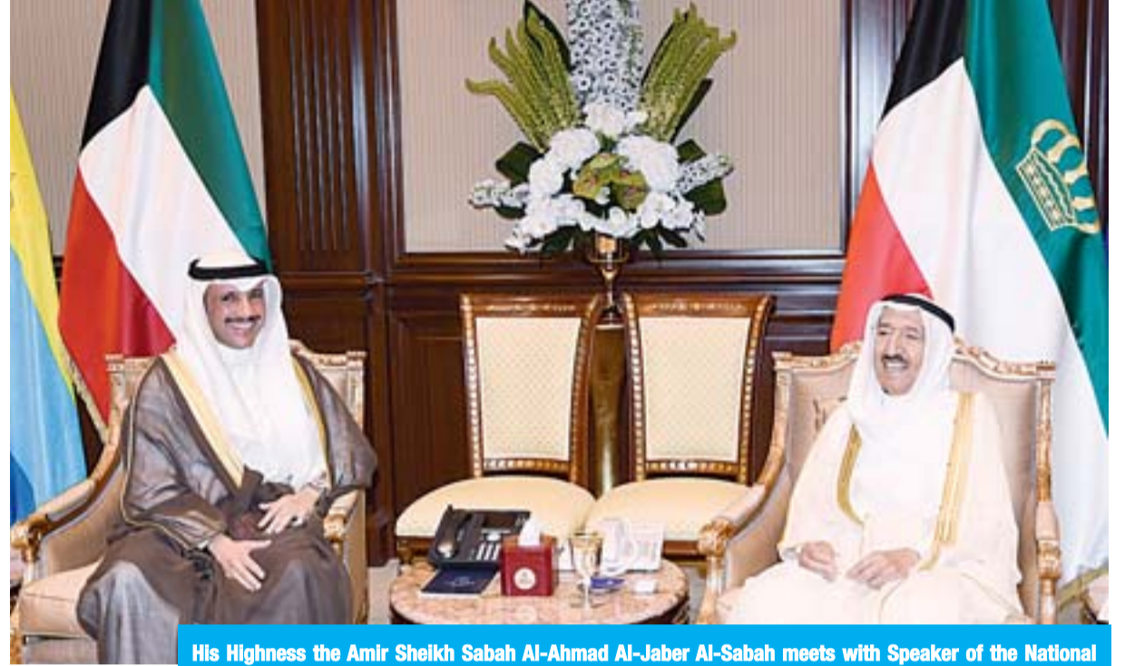
His Highness the Amir Sheikh Sabah Al-Ahmad Al-Jaber Al-Sabah meets with Speaker of the National Assembly Marzuq Al-Ghanem.

KUWAIT: His Highness the Amir Sheikh Sabah Al-Ahmad Al-Jaber Al-Sabah received at Bayan Palace yesterday His Highness the Crown Prince Sheikh Nawaf Al-Ahmad Al-Jaber Al-Sabah, His Highness the Amir also received Speaker of the National Assembly Marzuq Al-Ghanem and His Highness the Prime Minister Sheikh Jaber Al-Mubarak Al-Hamad Al-Sabah. Meanwhile, His Highness the Crown Prince received Ghanem, His Highness Sheikh Jaber Al-Mubarak, Deputy Prime Minister and Minister of Foreign Affairs Sheikh Sabah Al-Khaled Al-Hamad Al-Sabah and Deputy Prime Minister and Minister of Interior Sheikh Khaled Al-Jarrah Al-Sabah. —KUNA