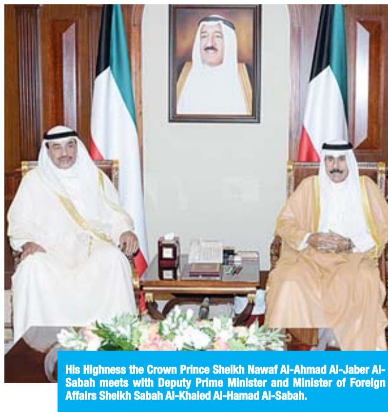
His Highness the Crown Prince Sheikh Nawaf Al-Ahmad Al-Jaber Al-Sabah meets with Deputy Prime Minister and Minister of Foreign Affairs Sheikh Sabah Al-Khaled Al-Hamad Al-Sabah.