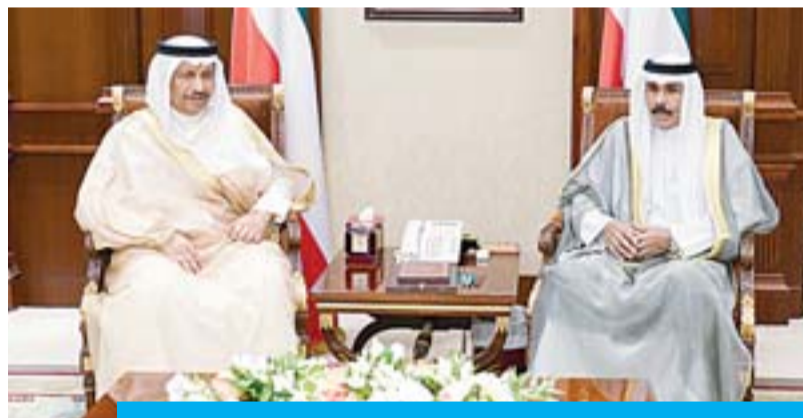
His Highness the Crown Prince Sheikh Nawaf Al-Ahmad Al-Jaber Al-Sabah meets with His Highness the Prime Minister Sheikh Jaber Al-Mubarak Al-Hamad Al-Sabah.