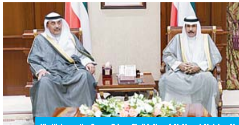
His Highness the Crown Prince Sheikh Nawaf Al-Ahmad Al-Jaber Al-Sabah meets with Deputy Prime Minister and Foreign Minister Sheikh Sabah Al-Khaled Al-Hamad Al-Sabah.