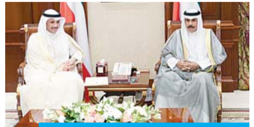
His Highness the Crown Prince Sheikh Nawaf Al-Ahmad Al-Jaber Al-Sabah meets with Speaker of the National Assembly Marzouq Ali Al-Ghanem.