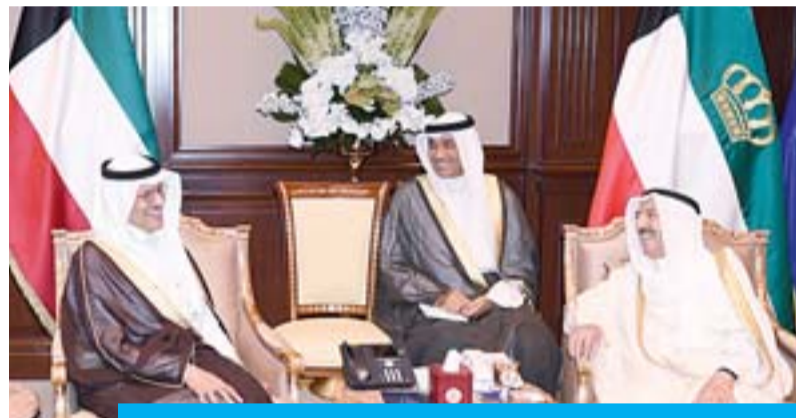
His Highness the Amir Sheikh Sabah Al-Ahmad Al-Jaber Al-Sabah meets with Saudi Minister for Energy Affairs Abdulaziz bin Salman Al Saud.