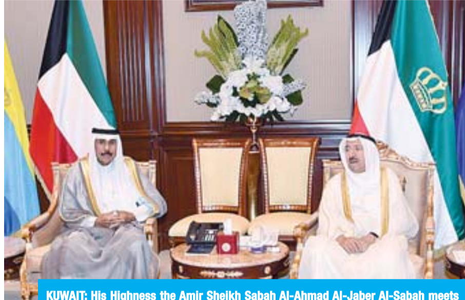
KUWAIT: His Highness the Amir Sheikh Sabah Al-Ahmad Al-Jaber Al-Sabah meets with His Highness the Crown Prince Sheikh Nawaf Al-Ahmad Al-Jaber Al-Sabah.

Sheikh Sabah meets visiting Saudi Minister for Energy