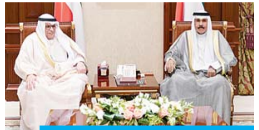
His Highness the Crown Prince Sheikh Nawaf Al-Ahmad Al-Jaber Al-Sabah meets with Deputy Prime Minister and Minister of Interior Sheikh Khaled Al-Jarrah Al-Sabah.

KUWAIT: His Highness the Amir Sheikh Sabah Al-Ahmad Al-Jaber Al-Sabah received yesterday at Bayan Palace His Highness the Crown Prince Sheikh Nawaf Al-Ahmad Al-Jaber Al-Sabah. His Highness the Amir also received Speaker of the National Assembly Marzouq Ali Al-Ghanem, His Highness