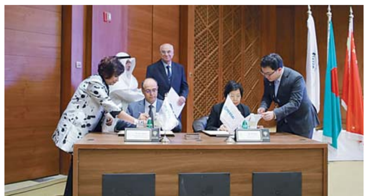
KUWAIT: ARABOSAI and ASOSAI chiefs sign the memorandum of understanding.