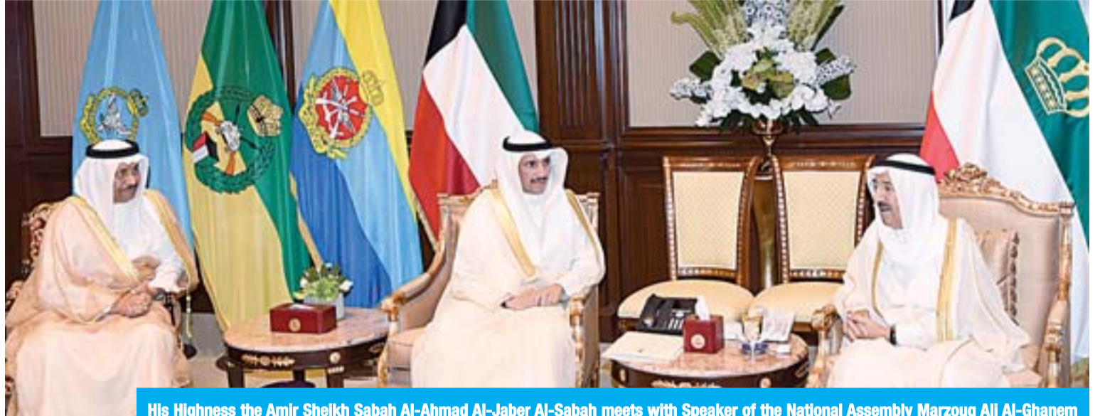
His Highness the Amir Sheikh Sabah Al-Ahmad Al-Jaber Al-Sabah meets with Speaker of the National Assembly Marzouq Ali Al-Ghanem and His Highness the Prime Minister Sheikh Jaber Al-Mubarak Al-Hamad Al-Sabah.