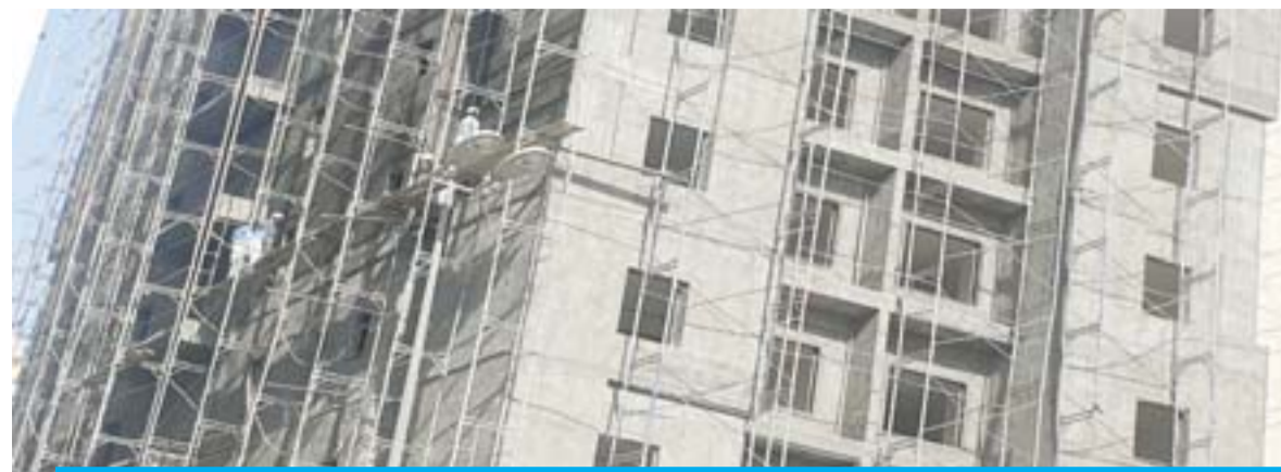
KUWAIT: Workers are seen at a Farwaniya construction site (Block 1, Near Omariya) at 3:00 pm.