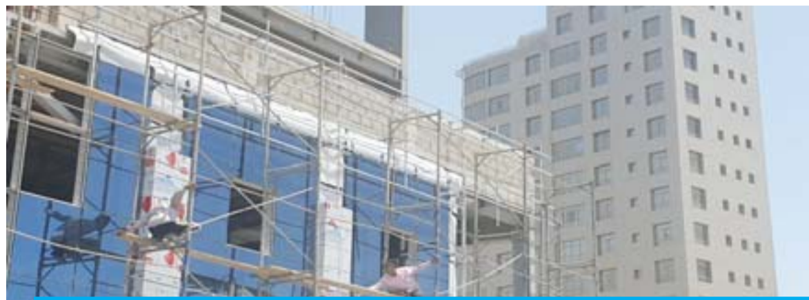
Construction workers at a building in front of Al-Bahar Mall in Hawally at 11:16 am.