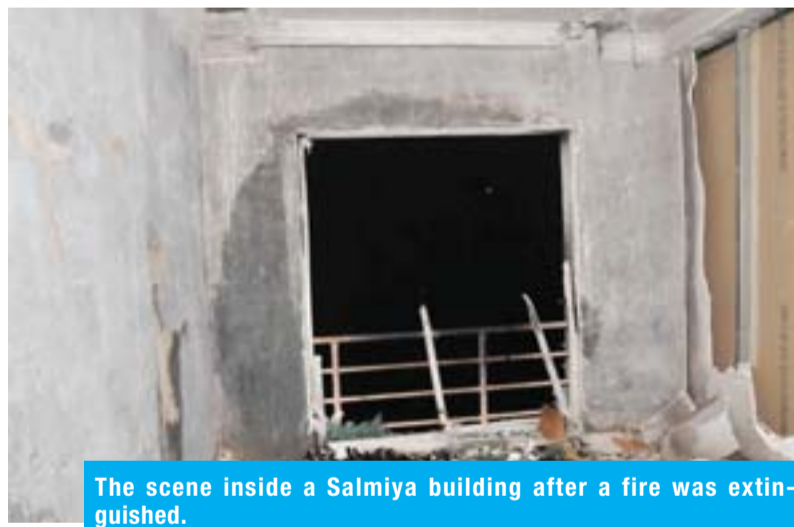
The scene inside a Salmiya building after a fire was extinguished.