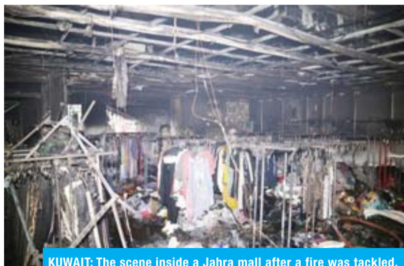
KUWAIT: The scene inside a Jahra mall after a fire was tackled.

The delegation of the Kuwaiti MoI participating in