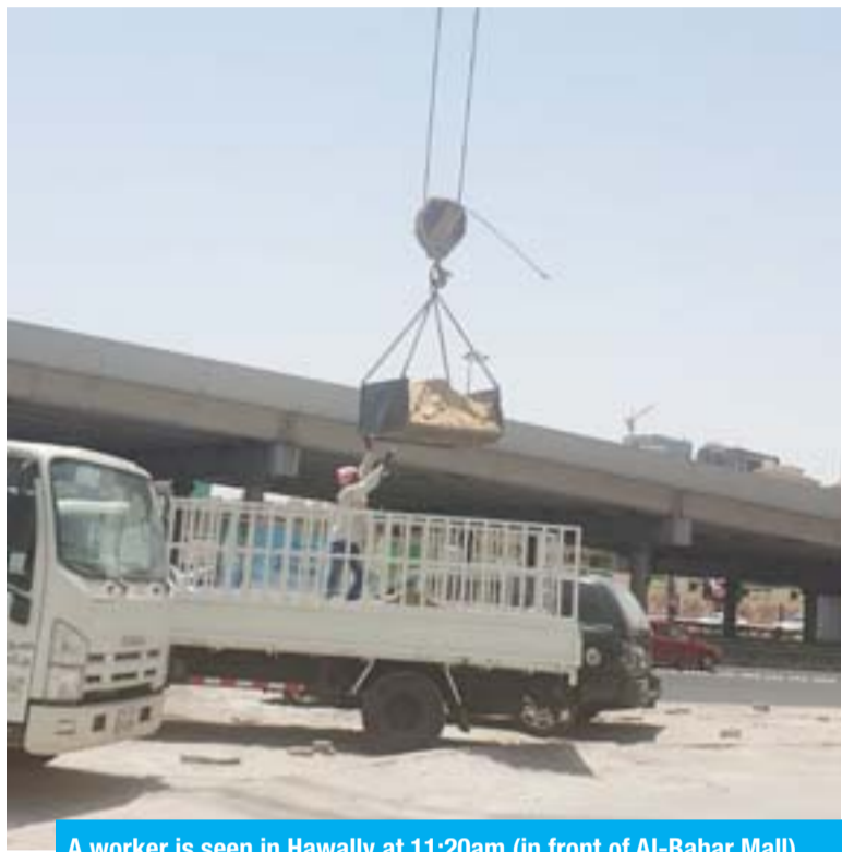
A worker is seen in Hawally at 11:20am (in front of Al-Bahar Mall).