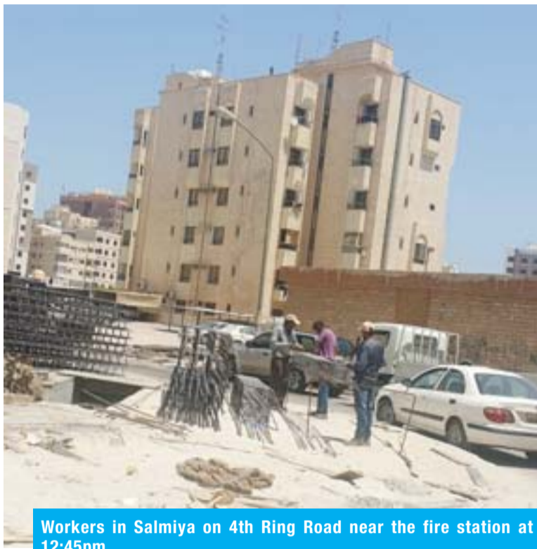
Workers in Salmiya on 4th Ring Road near the fire station at 12:45pm.