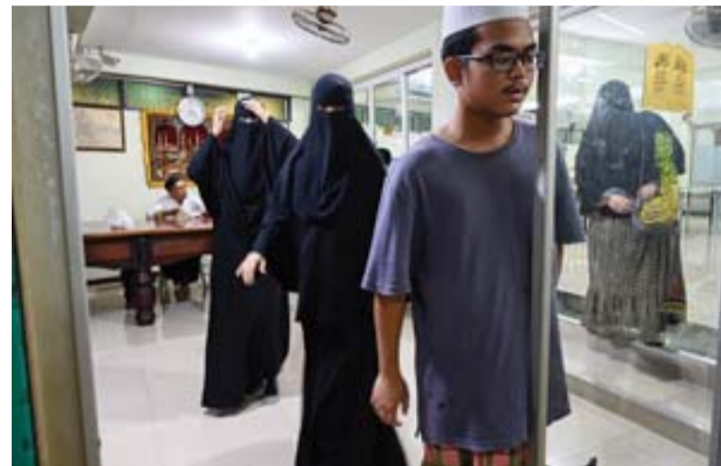
Thai Muslims leaving Darul Falah mosque after breaking fast during the Islamic holy month of Ramadan in Bangkok.