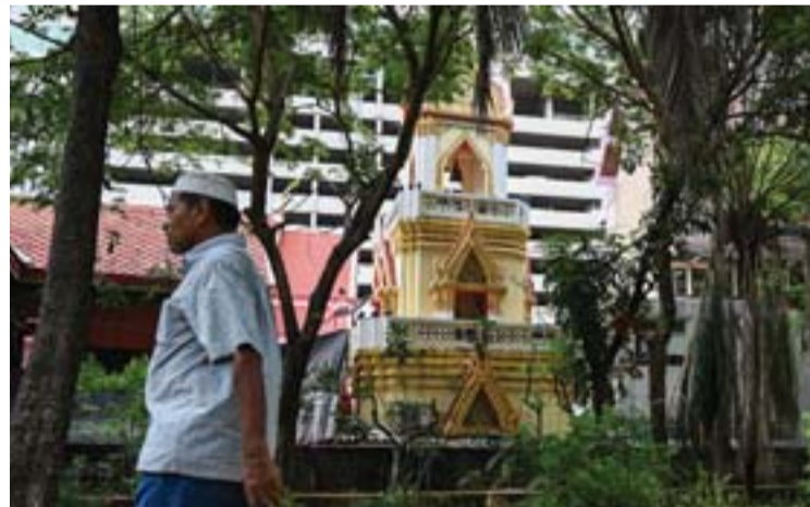
A Thai Muslim man walking in the compound of Haroon mosque next to a Buddhist monastery (back) in Bangkok.