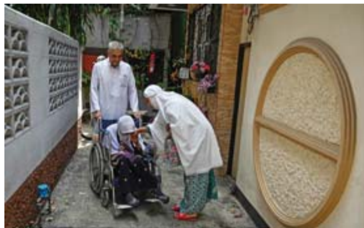
A Thai Muslim woman in a wheelchair paying her respects to an older woman near Haroon mosque in Bangkok.