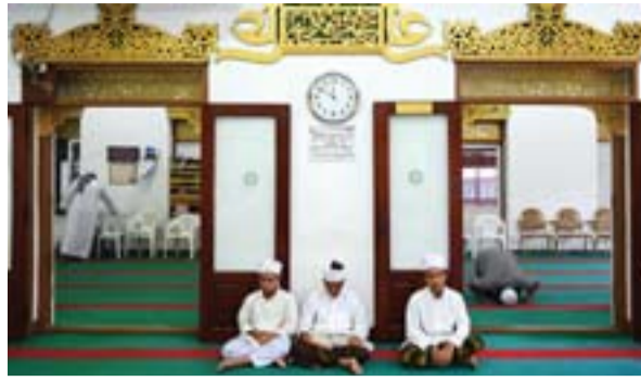
A Thai Muslim youth (center) reading a copy of the holy Quran before Friday noon prayers in Haroon mosque in Bangkok.