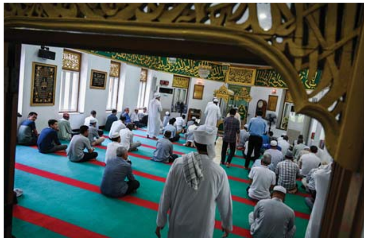
Muslim devotees arriving for the Friday noon prayers in Haroon mosque in Bangkok.