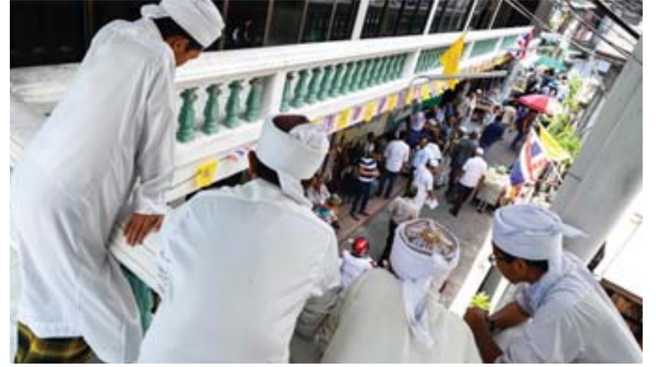
Thai Muslim youths gathering outside the Haroon mosque in Bangkok.