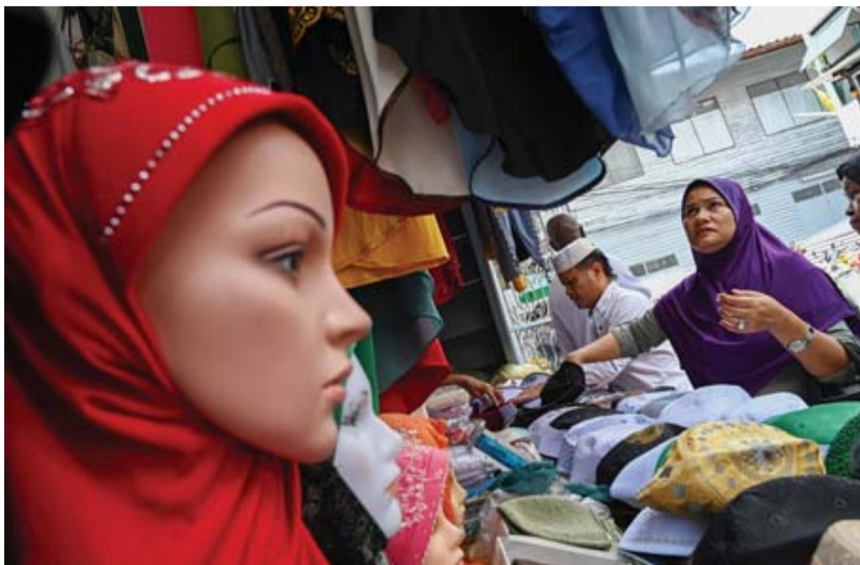
A Thai Muslim woman browsing hijabs at a stall on the sidewalk near Haroon mosque in Bangkok.