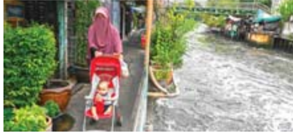
A Thai Muslim woman pushing a baby in a stroller along an alley by a canal near Darul Falah mosque in Bangkok.