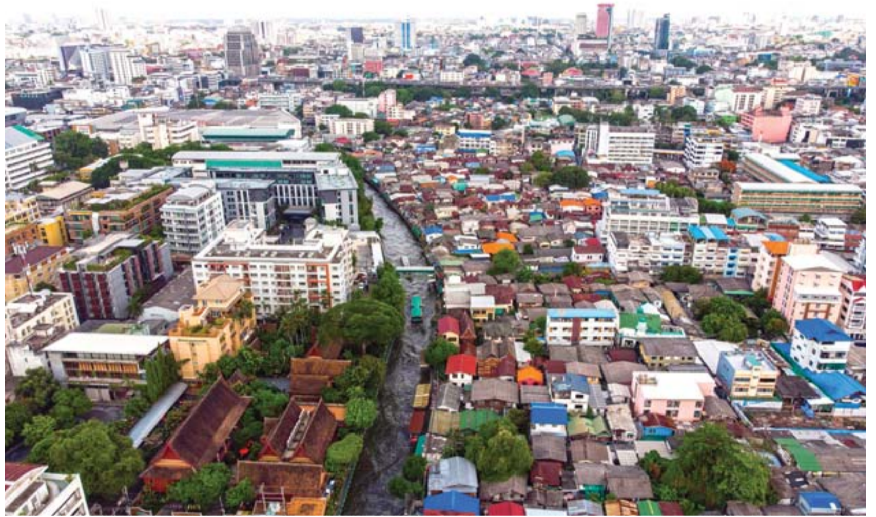
The community around Darul Falah mosque surrounded by traditional houses, a museum, shops and high-rise buildings traversed by a canal in Bangkok.