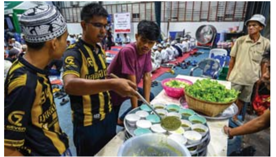
Thai Muslim volunteers serving soup to devotees for breaking fast during the Islamic holy month of Ramadan in Haroon mosque in Bangkok.