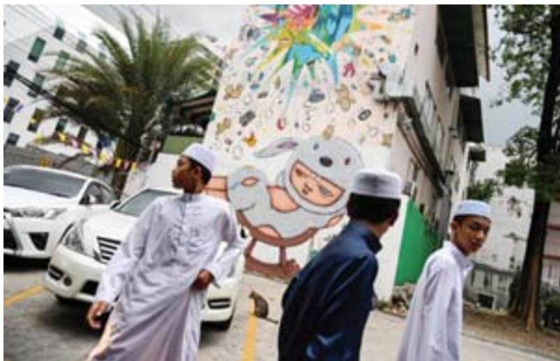
Thai Muslim youths walking to a mosque to break their fast during the Islamic holy month of Ramadan in Bangkok.