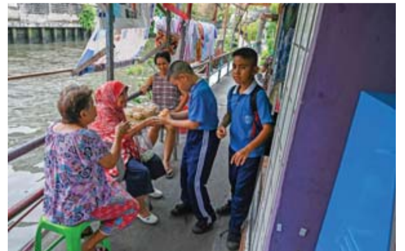
A boy paying his respects to an elderly Thai Muslim woman in their neighborhood in Bangkok.